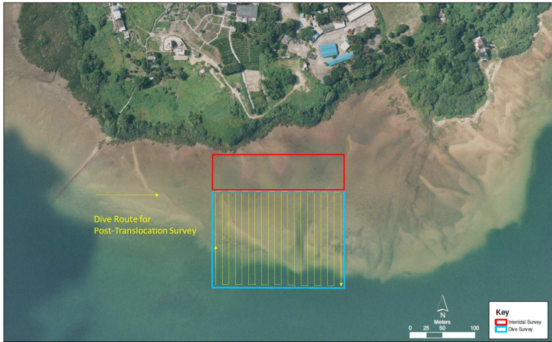
Figure 1. Original Post-Translocation Monitoring Survey Route at Ting Lok East