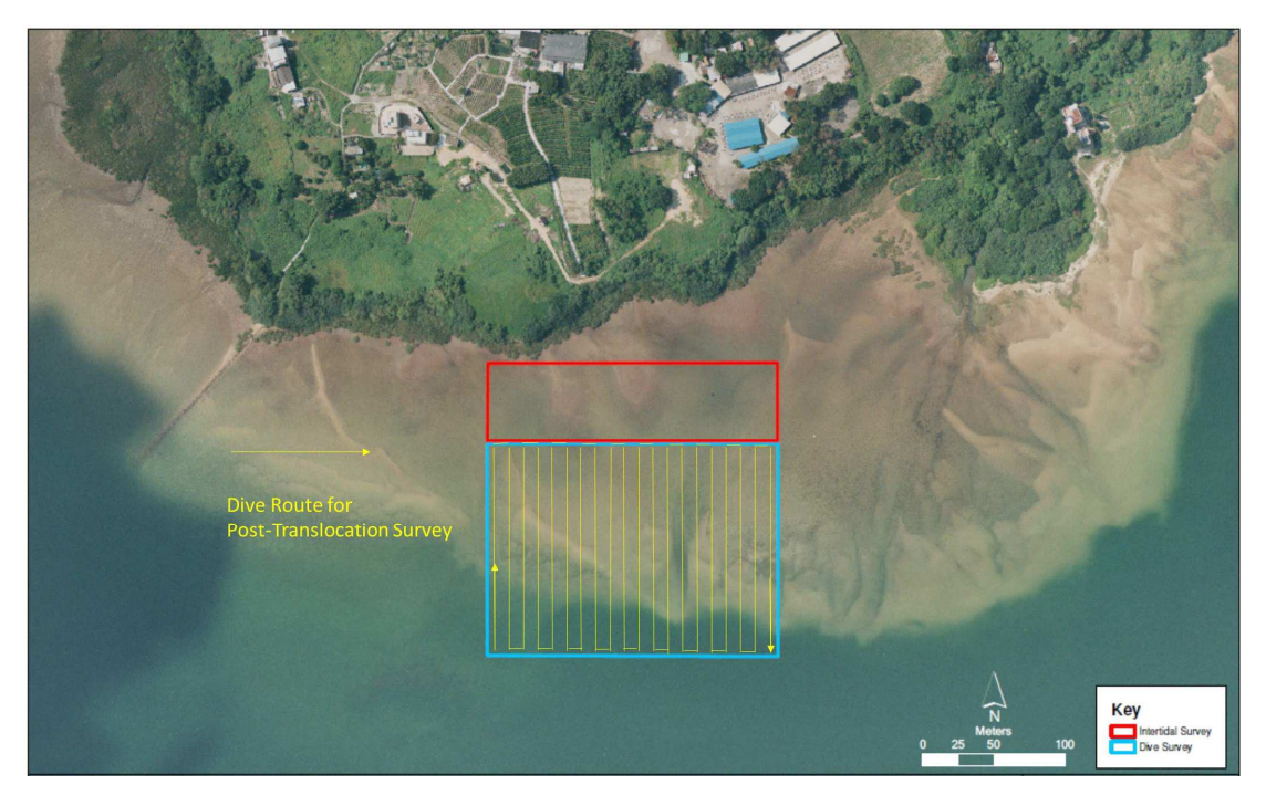
Figure 1. Original Post-Translocation Monitoring Survey Route at Ting Lok East