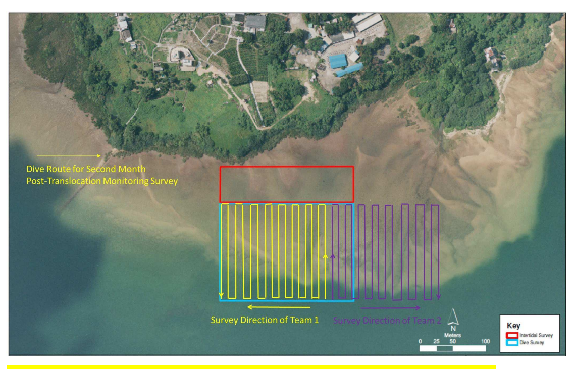
Figure 2. Second Month Post-Translocation Survey Route at Ting Kok East