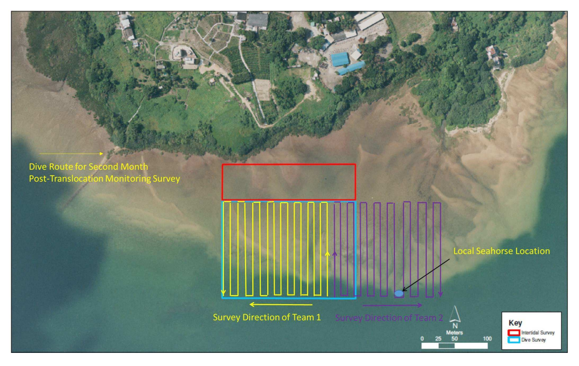
Figure 3 Location of Local Seahorse Recorded at Ting Kok East