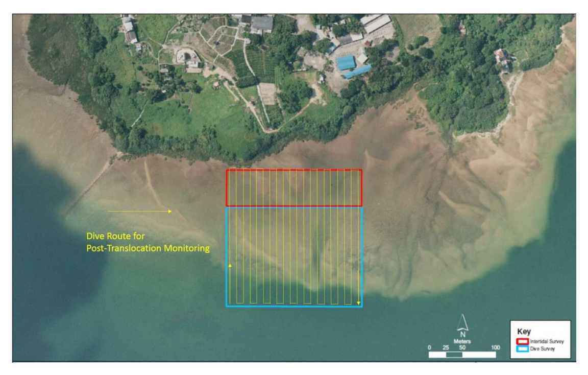
Figure 1. Original Post-Translocation Monitoring Survey Route at Ting Kok East