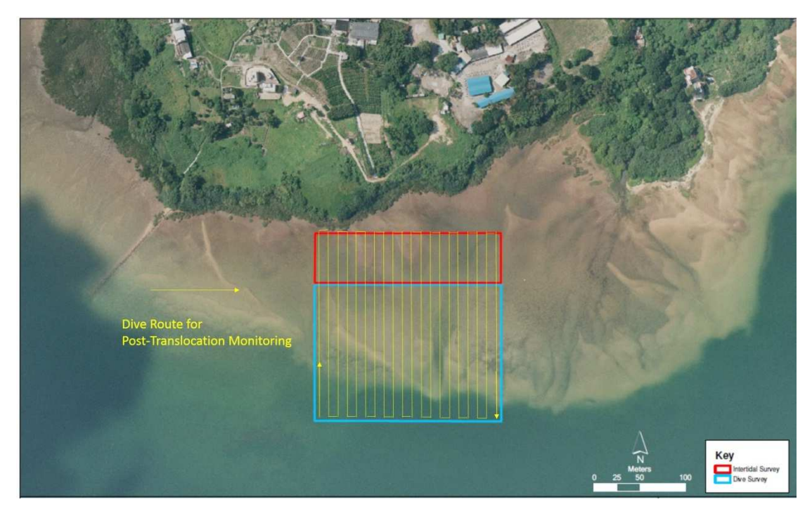
Figure 1. Original Post-Translocation Monitoring Survey Route at Ting Kok East