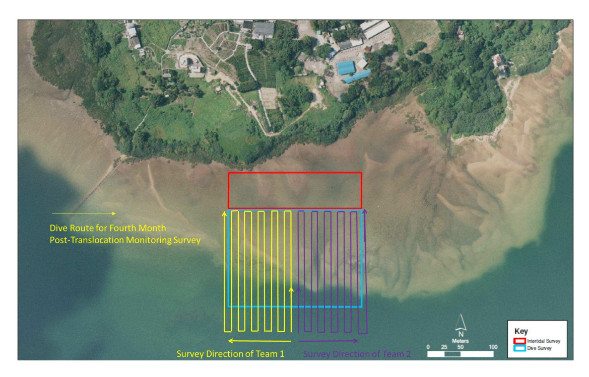
Figure 3 Suggested Survey Route for Fourth Month Post-Translocation Survey