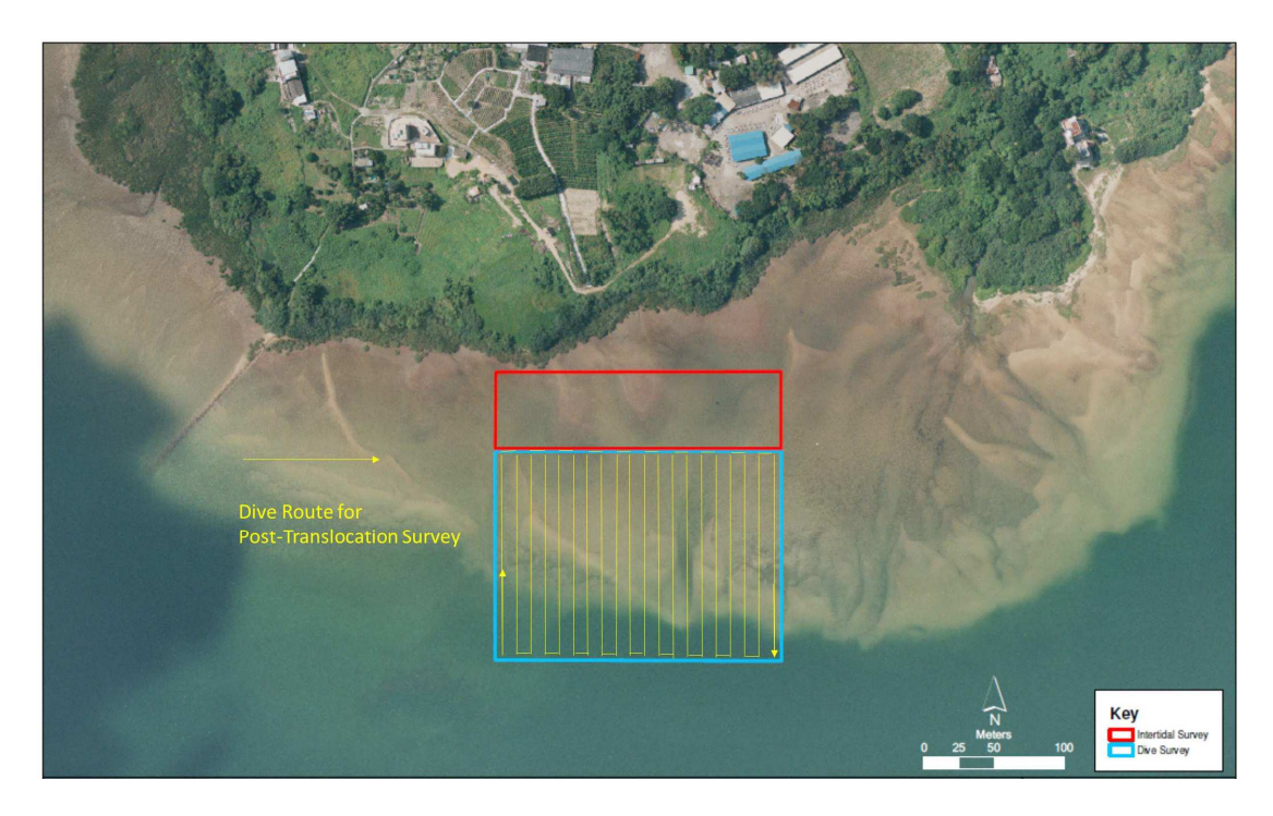
Figure 1. Original Post-Translocation Monitoring Survey Route at Ting Kok East