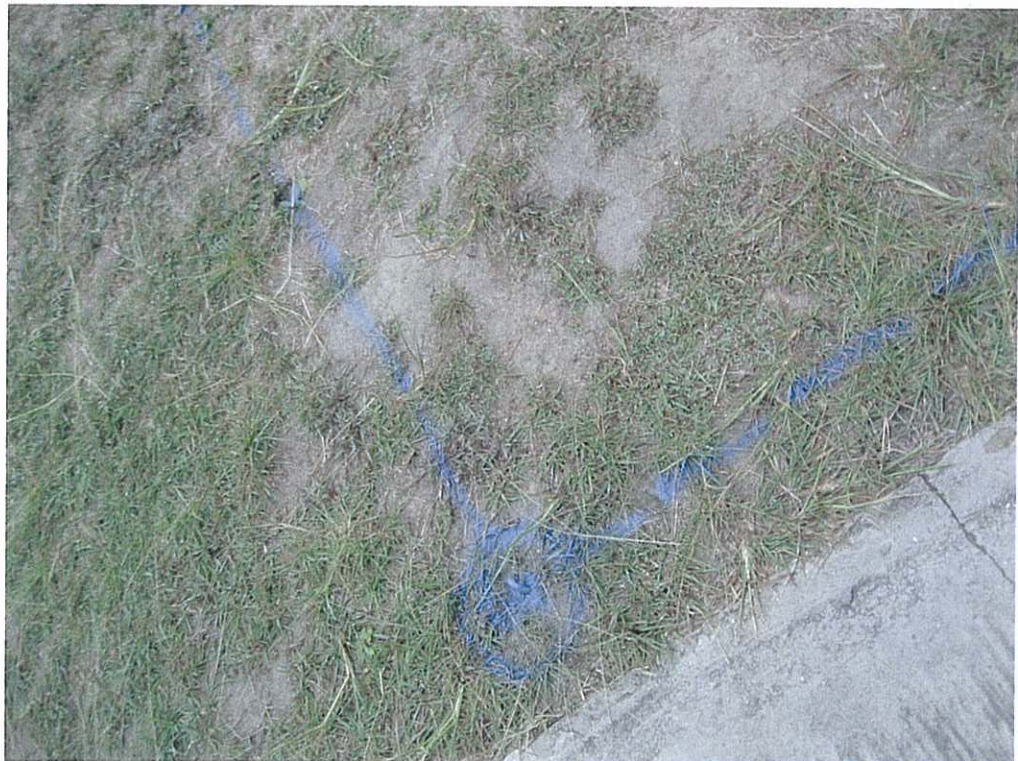
Photo 2 - Some paint marking on soil and grassland was observed at the temporary worksite for underground pipe and cabling works.