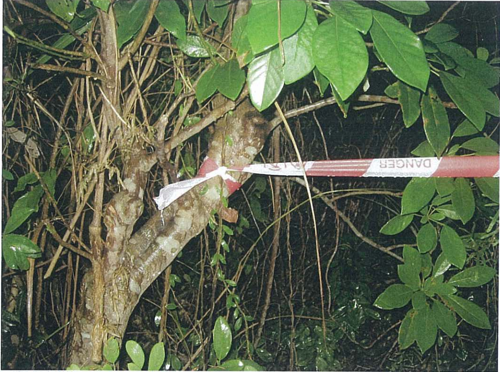
Photo 1 - Plastic warning tape was observed tied on trees at the temporary worksite for underground pipe and cabling works.