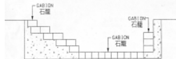
TRAPEZOIDAL CHANNEL WITH GABION BASE AND WALL

KT15 : CH +0 - CH +150 & CH +550 - CH +686