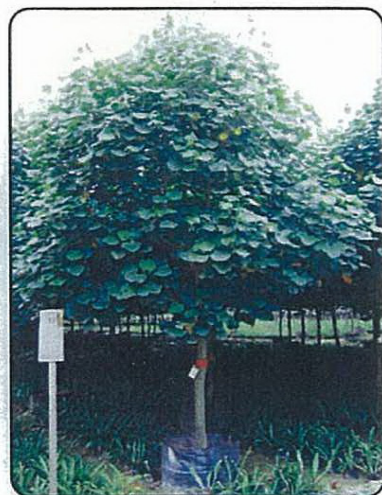
Hibiscus tiliaceus (黃槿)