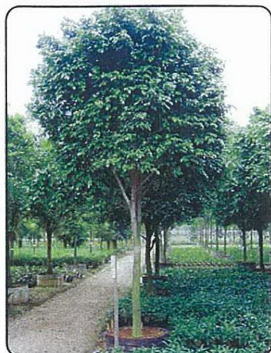
Ficus benjamina (垂葉榕)