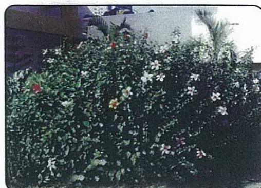
Hibiscus rosa-sinensis (紅葉大紅花)