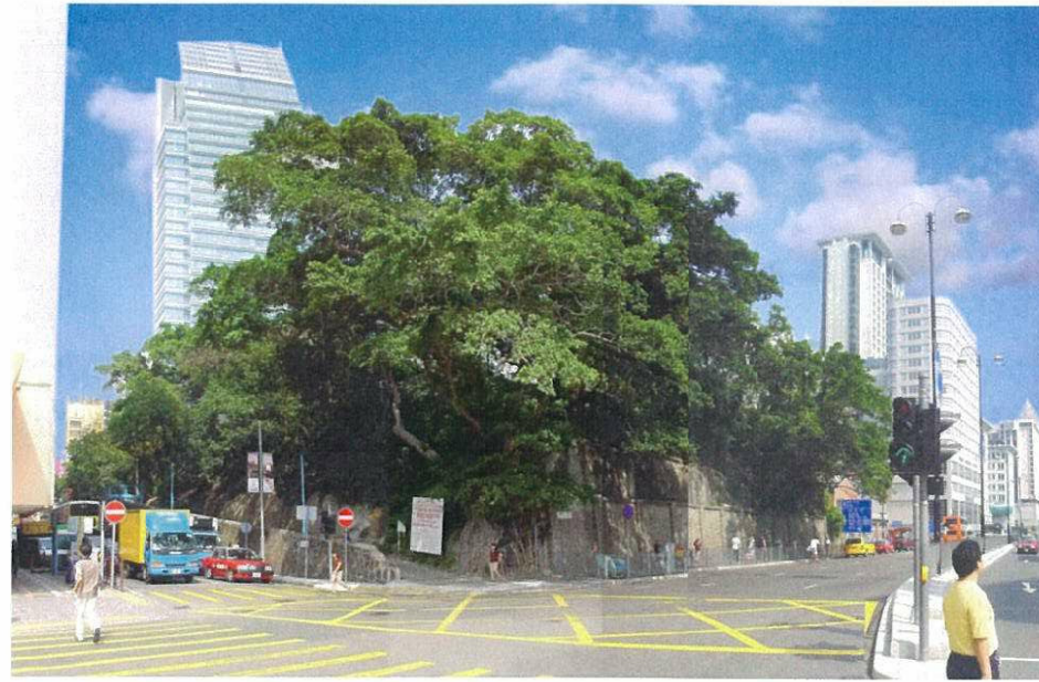
Existing view north east from the intersection of Canton Road and Salisbury Road