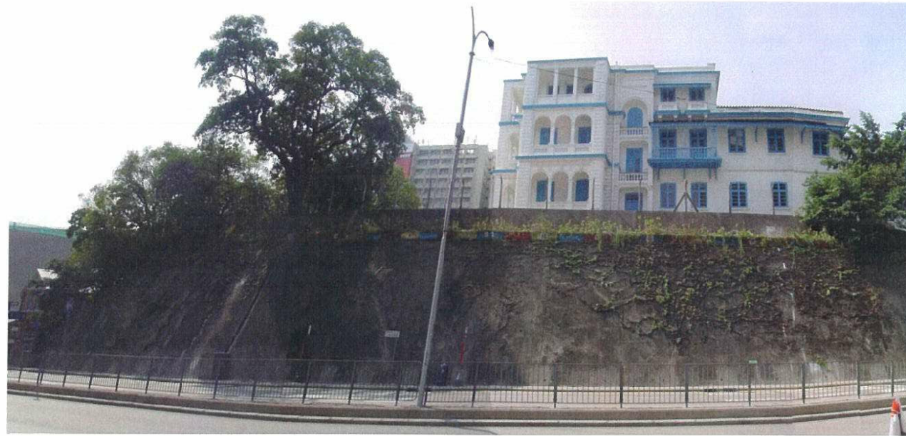
Existing view west from Kowloon Park Drive