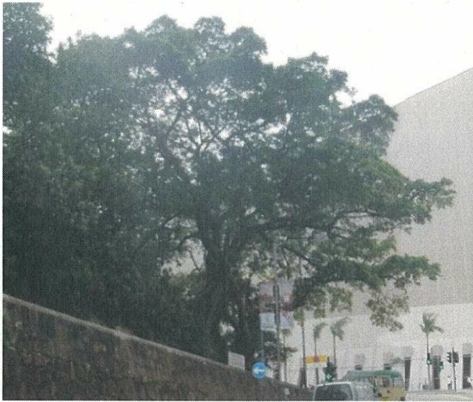
VIT T66/T67 View from Canton Road