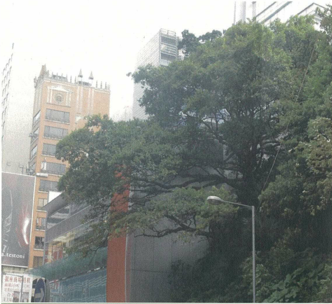
T120, T121 and T122 View from Canton Road