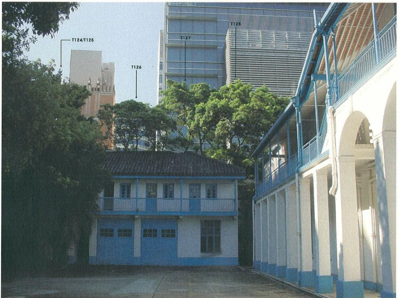
VIT T128 and retained trees on the northern boundary of the site.