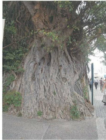
VIT T66/T67 Detail Photograph of Root Structure