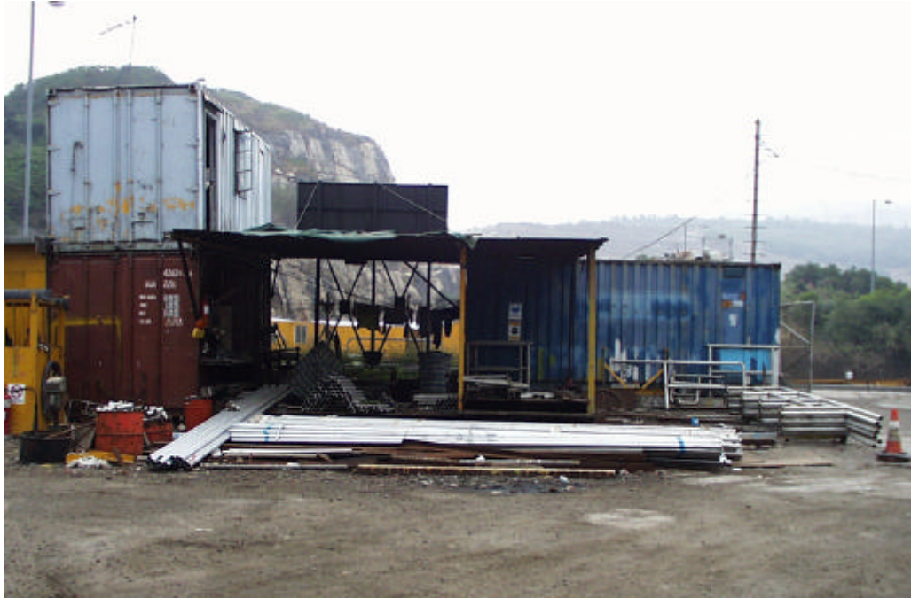
Photo 105 Maintenance Depot : Metal Parts Piled Up Beside the Entrance (17 Mar 99)