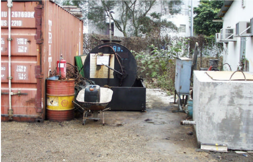
Photo 103 Maintenance Depot : Storage Tank for Petroleum Products (17 Mar 99)