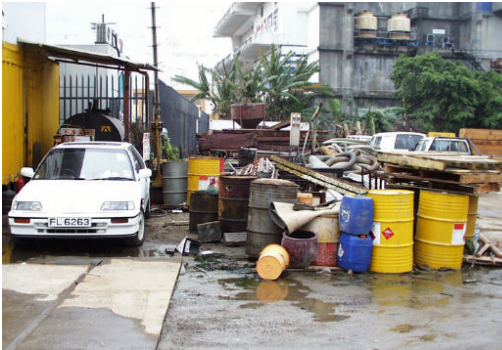
Photo 104 Maintenance Depot : Storage Tank for Petroleum Products (17 Mar 99)