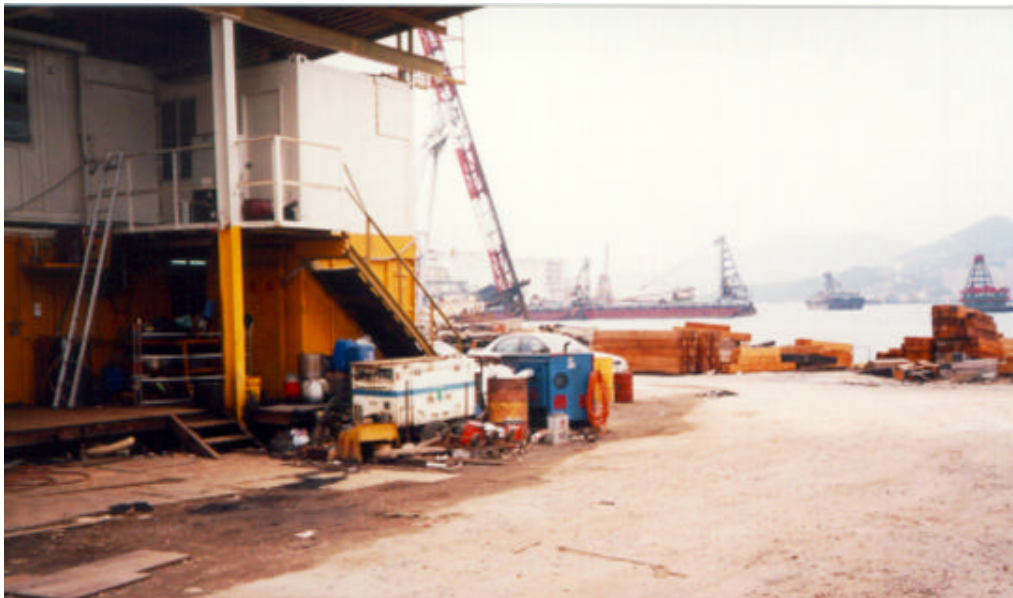
Photo 106 Maintenance Depot : Piled Up Metal Parts Outside Site Office (17 Mar 99)