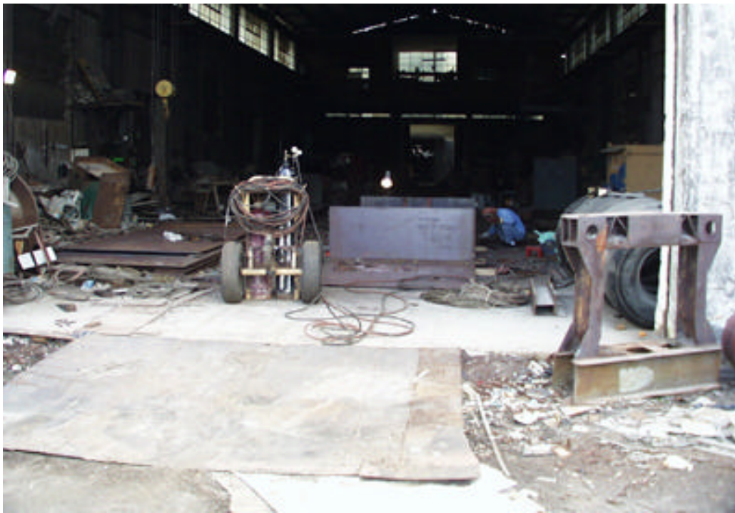
Photo 10 YTML 6-11 : Ship repair workshop in operation (24 Dec 98)