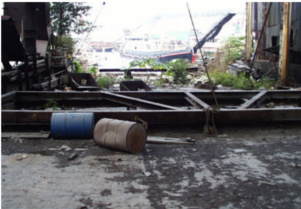
Photo 8 YTML 6-11 : Jetty at the east side of the ship repair workshop, not in use anymore (24 Dec 98)