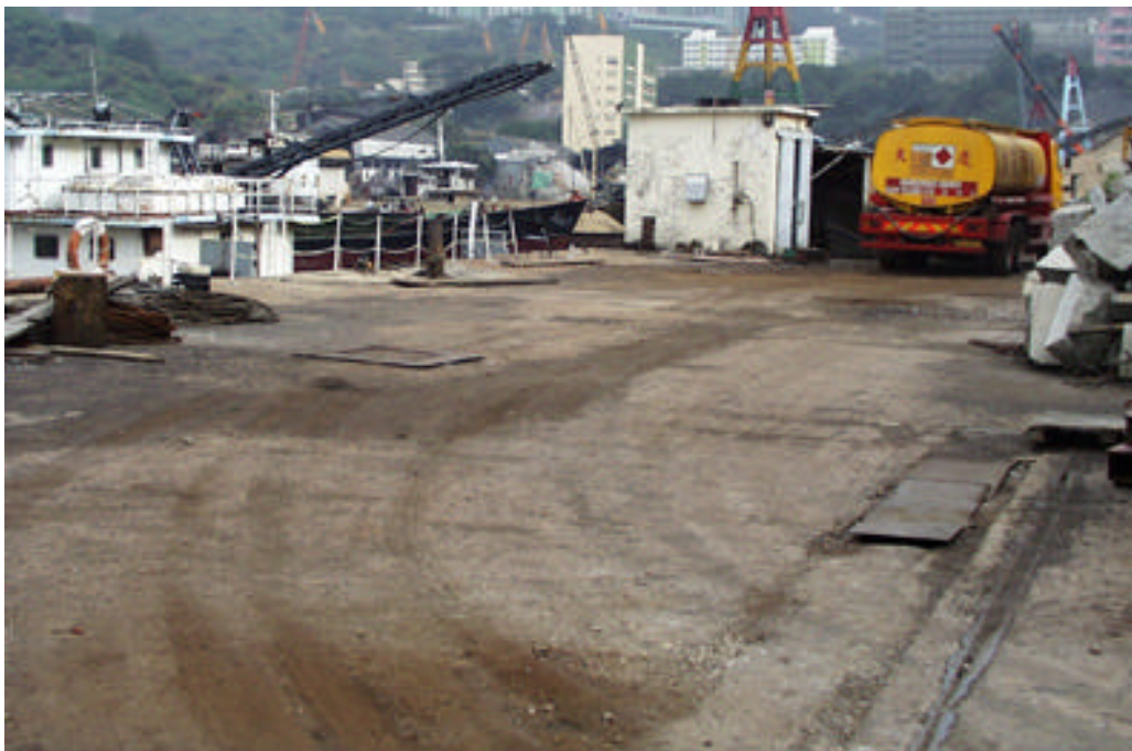
Photo 12 YTML 6-11 : Approximate location of the underground fuel storage (24 Dec 98)