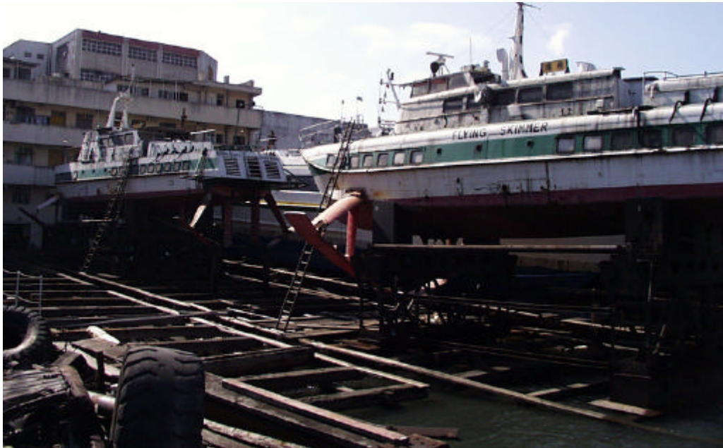
Photo 7 YTML 6-11 : Operating jetty at the west side of the ship repair workshop (5 Dec 98)