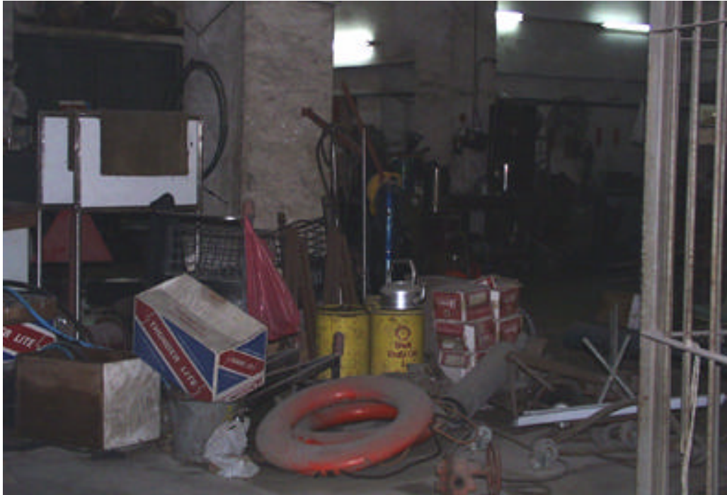
Photo 11 YTML 6-11 : Ship repair workshop in operation (24 Dec 98)