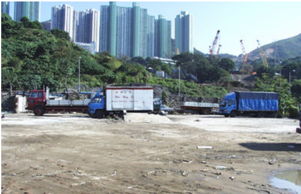
Photo 55 YTML 32-33 : Vacated lot area, location of former a ship repair jetty (5 Dec 98)