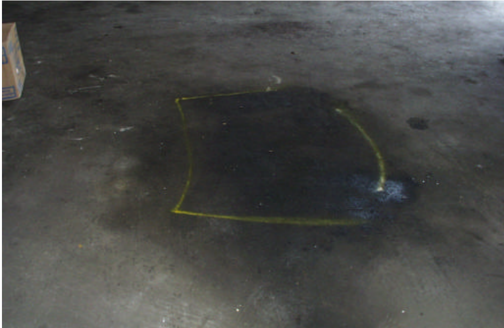
Photo 60 YTML 32-33 : Oil stain revealed inside the car repair workshop (26 Jan 99)