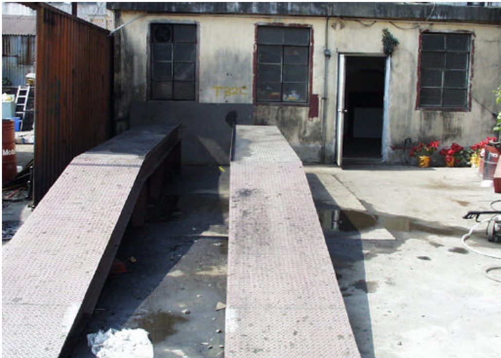
Photo 61 YTML 32-33 : Outdoor repair station at the back of the car repair workshop (26 Jan 99)