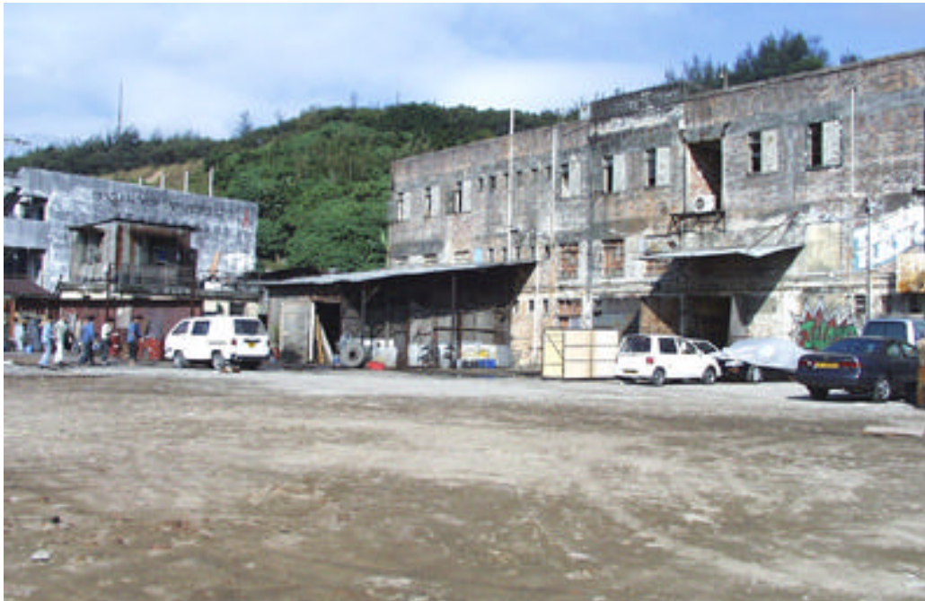
Photo 57 YTML 32-33 : The rear door of the car service centre (5 Dec 98)