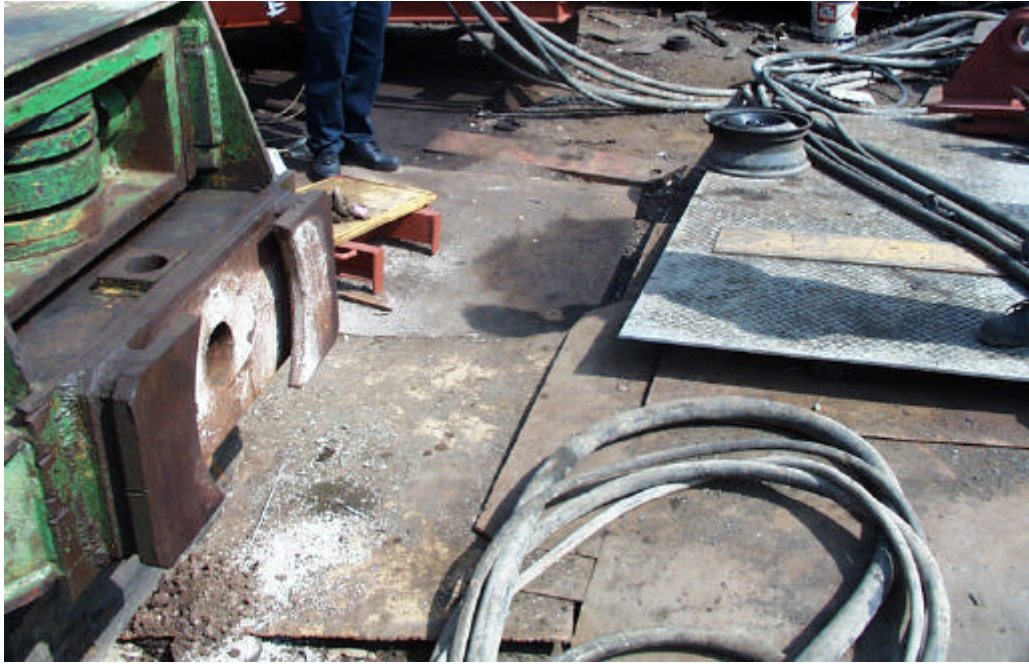
Photo 77 YTML 36-37 : Part of site covered with layers of metal sheets (26 Jan 99)