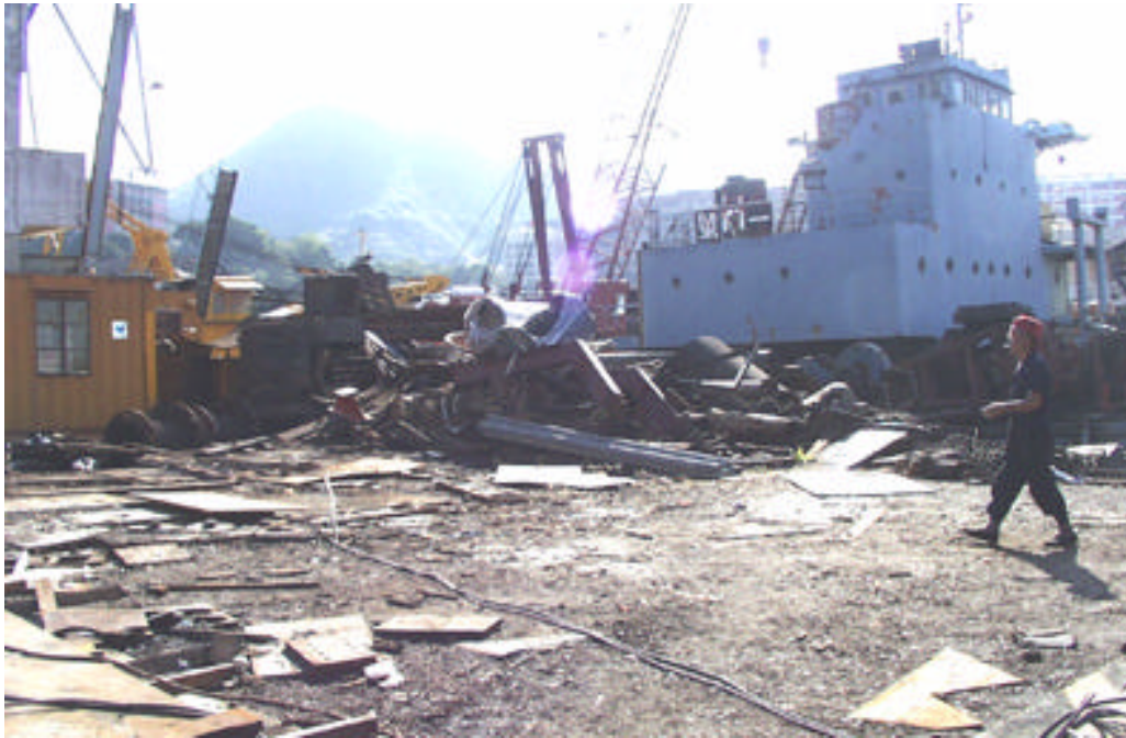
Photo 75 YTML 36-37 : Storage of dissembled parts on uncovered ground (5 Dec 98)