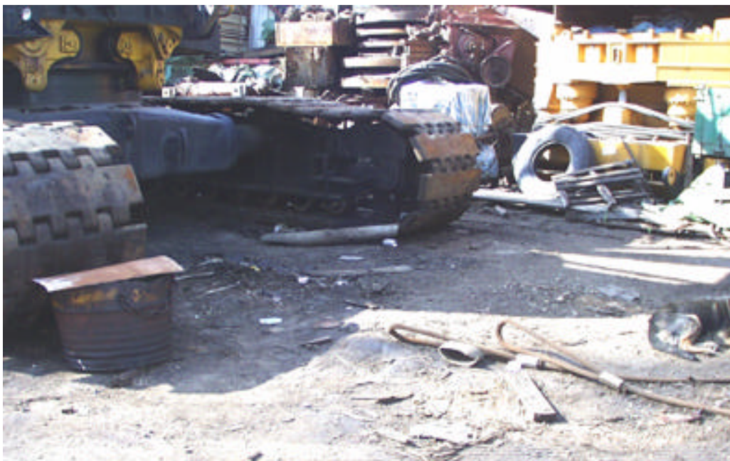
Photo 76 YTML 36-37 : Photo showing unpaved ground of the lot with oil satin (5 Dec 98)