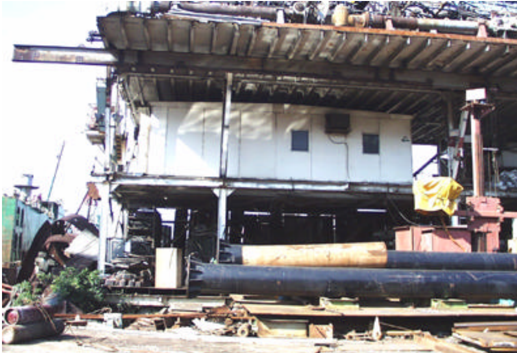
Photo 70 YTML 36-37 : Outlook of the machinery workshop and piled up parts outside the workshop (5 Dec 98)