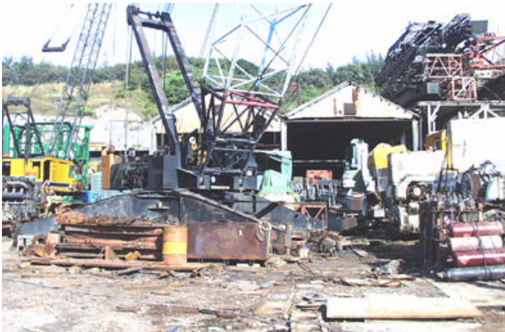
Photo 72 YTML 36-37 : Parts and machinery stored on the lot (5 Dec 98)