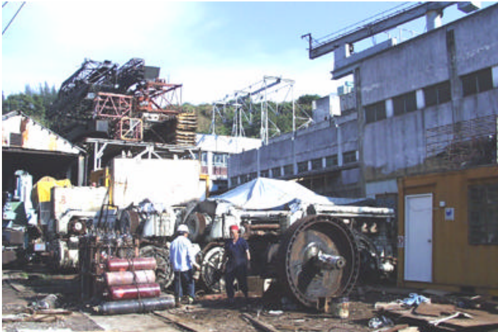
Photo 73 YTML 36-37 : Parts and machinery stored on the lot (5 Dec 98)