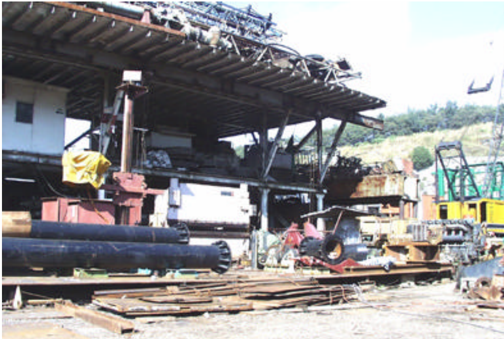
Photo 71 YTML 36-37 : Outlook of the machinery workshop and piled up parts outside the workshop (5 Dec 98)