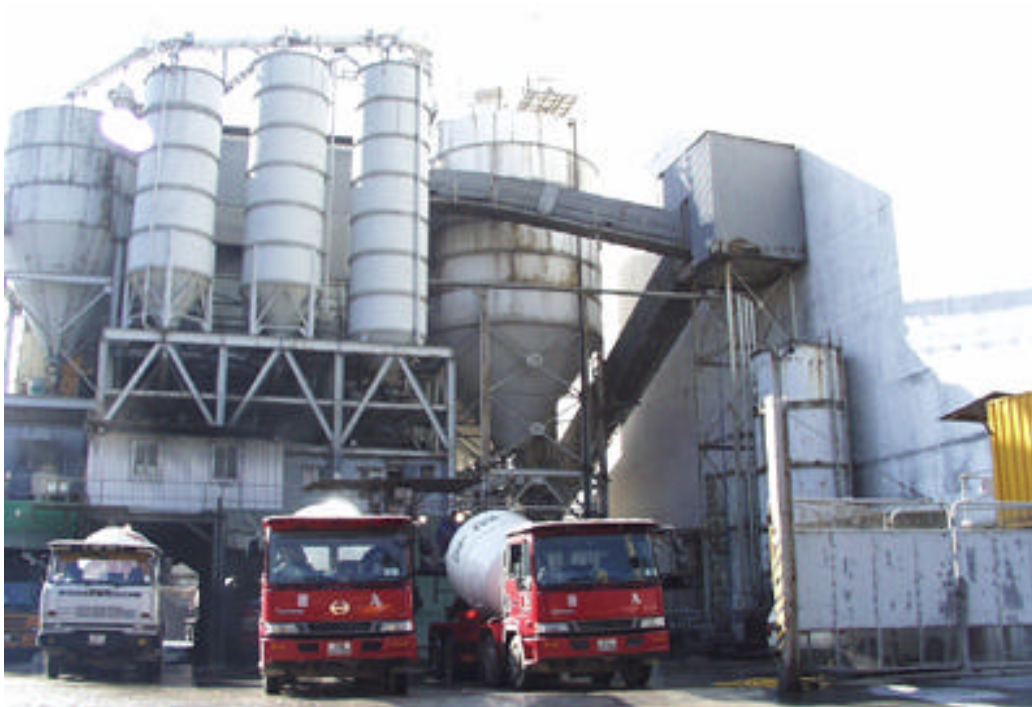
Photo 91 YTML45-46 : Concrete batching plant in operation (5 Dec 98)