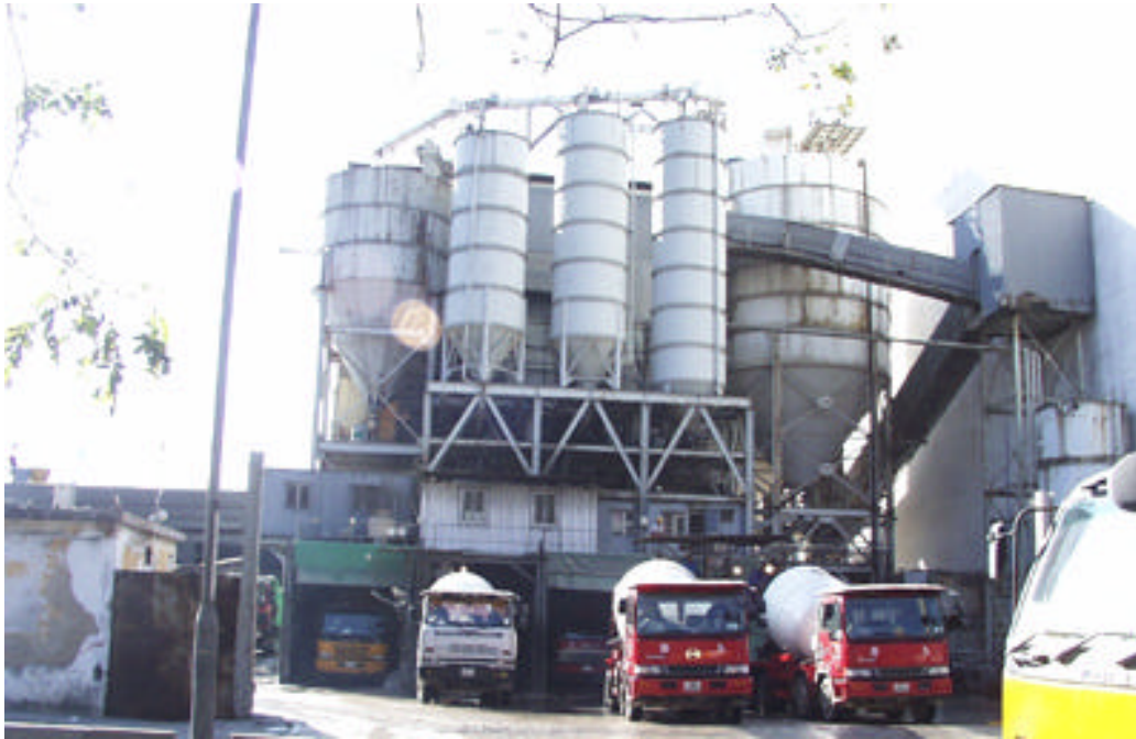
Photo 90 YTML45-46 : Concrete batching plant in operation (5 Dec 98)