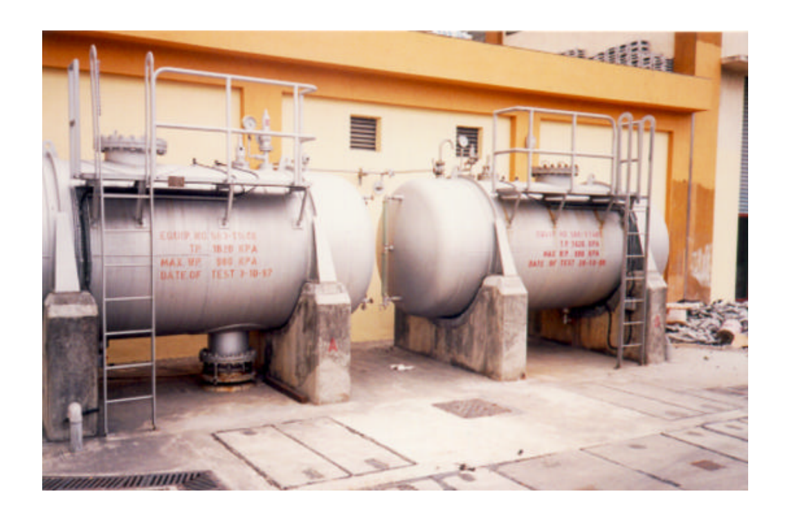
Photo 99 Two Surge Vessels Outside the Pumping Station (17 Mar 99)