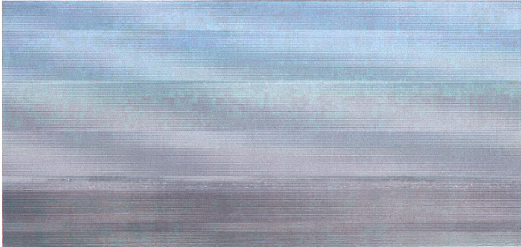
Existing Condition (Foreshore background is generic only)