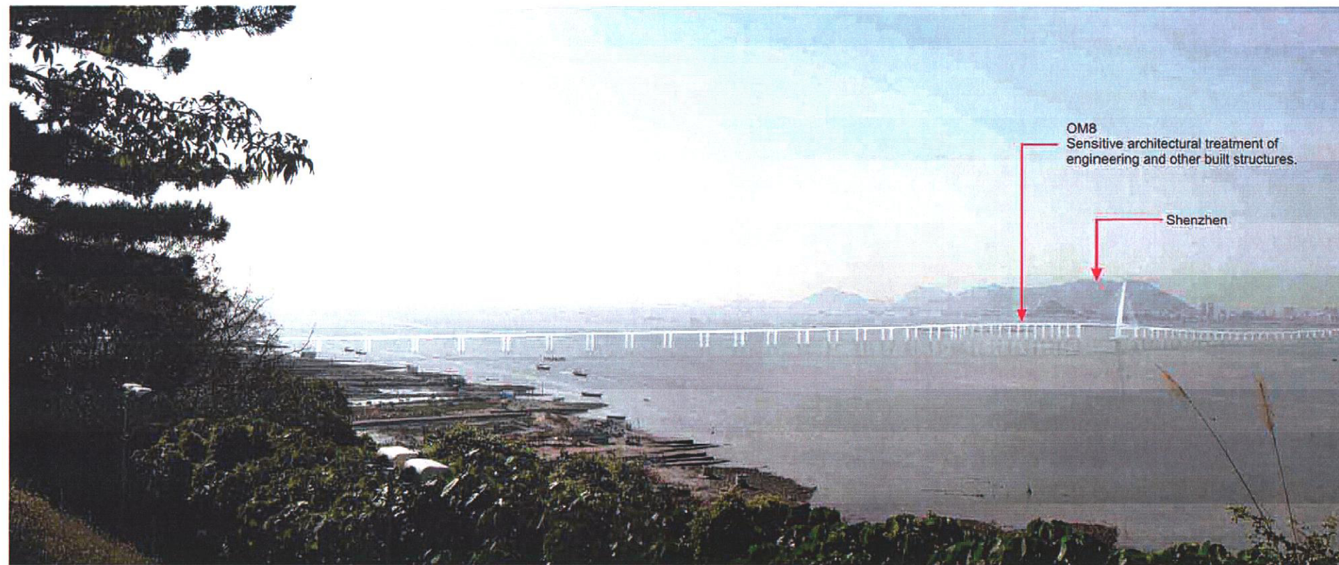
Proposed Bridge - Day 1 With/Without Mitigation and Year 10