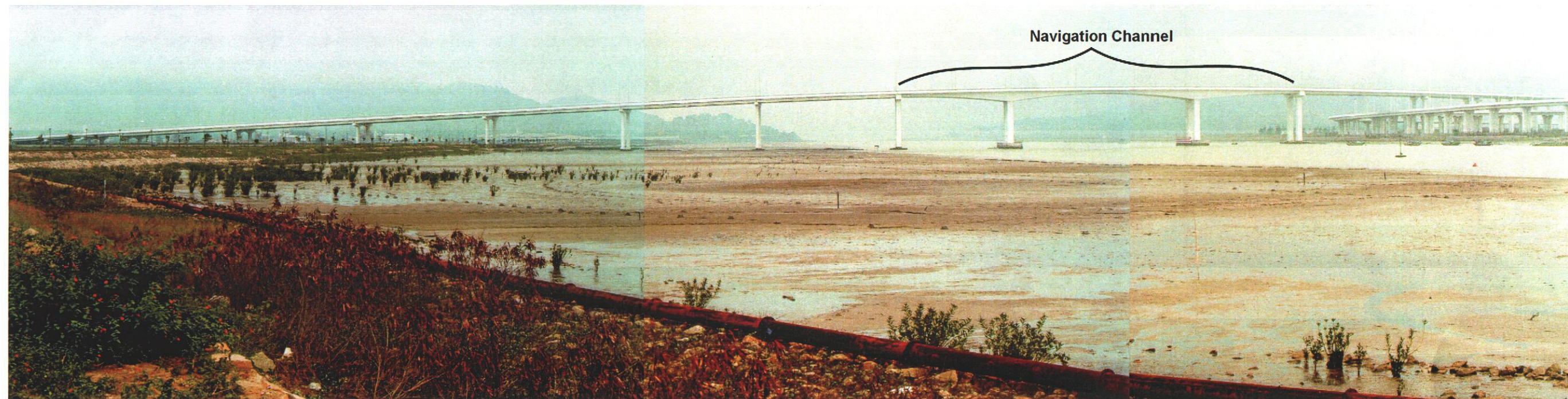
b Modified photograph showing piers spaced at 70m intervals left (east) of the navigation channel across the mudflat. This spacing approximates the 75m spacing proposed for the SWC bridge.