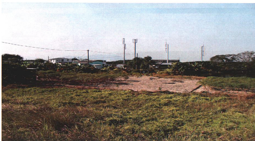
2. Sandy Deposit and Gardens in the Western Section