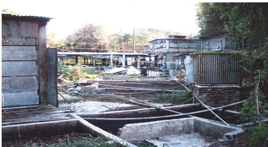
1. Houses in the Middle Section