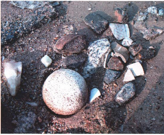
1. Stone and Ceramic Remains on the Beach