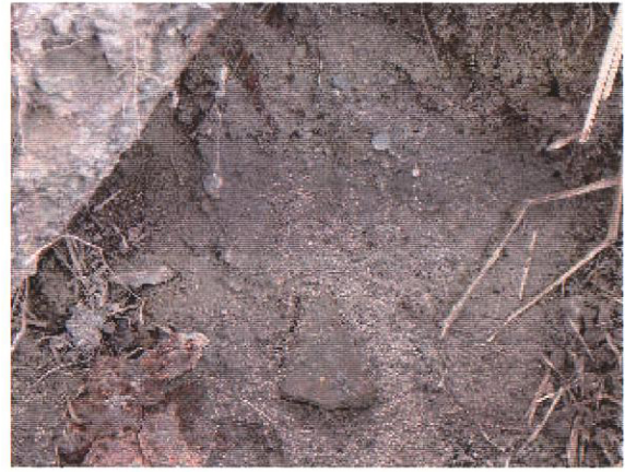
2. Flake and Pottery Sherd from FC7