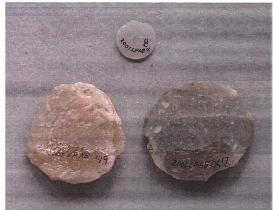
4. Waste or Unfinished Products of Stone Ring