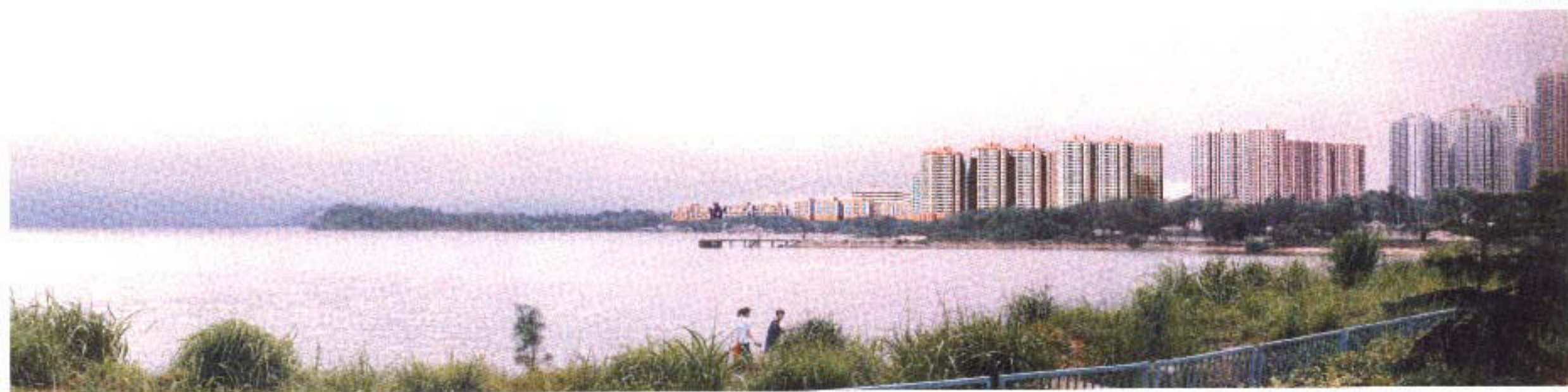
Photomontage View from Ma On Shan Town Park Impact During Construction