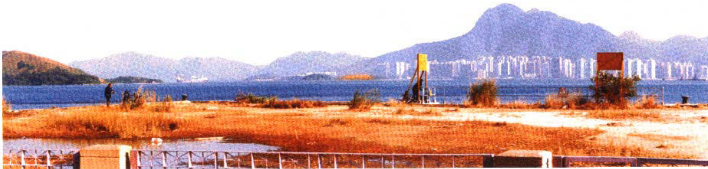
View from Tai Po Park (Key View No. 3), Existing Condition (For Location of View, see Figure 8.8)