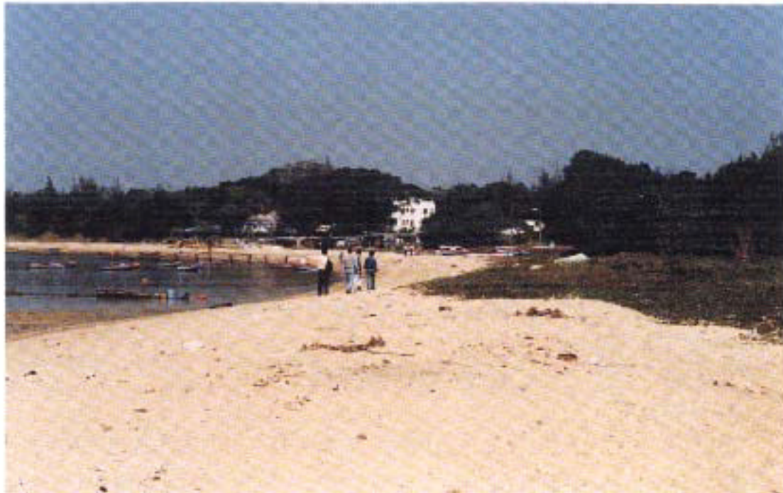
LCA3 - To Tau LCA