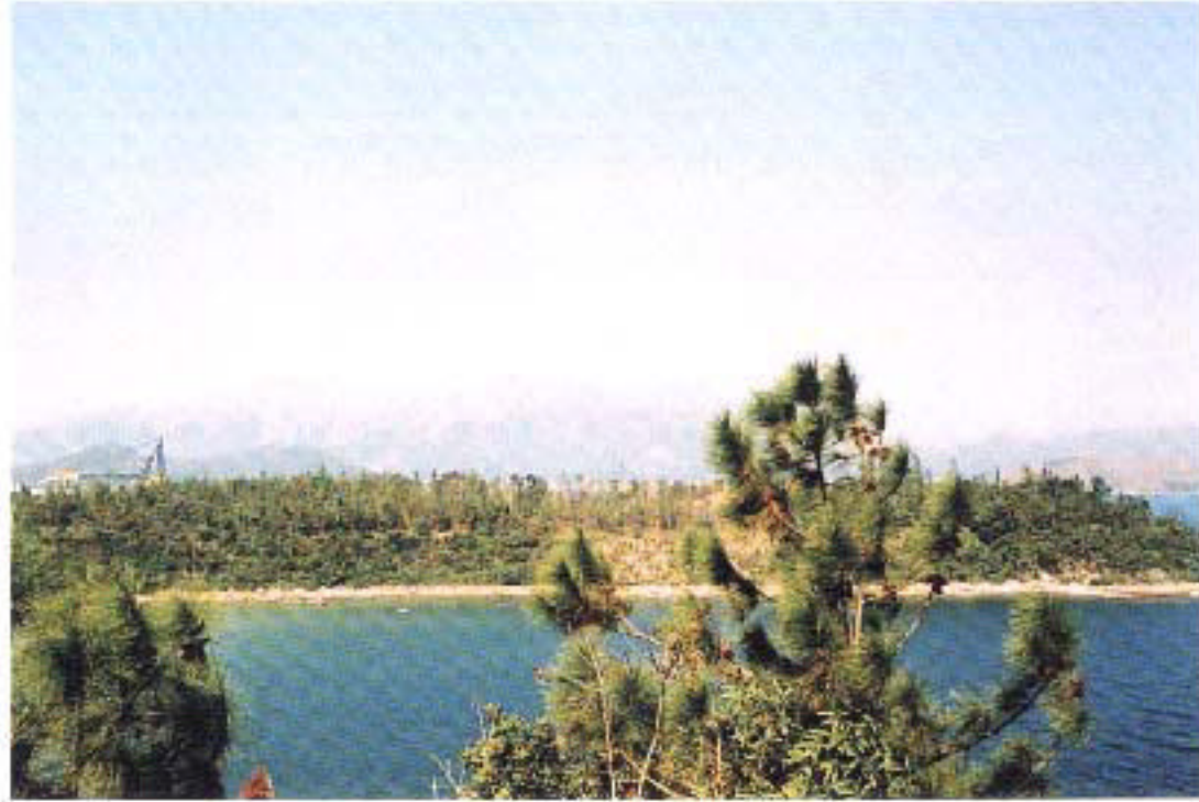
LCA2 - Whitehead Peninsula Coast LCA