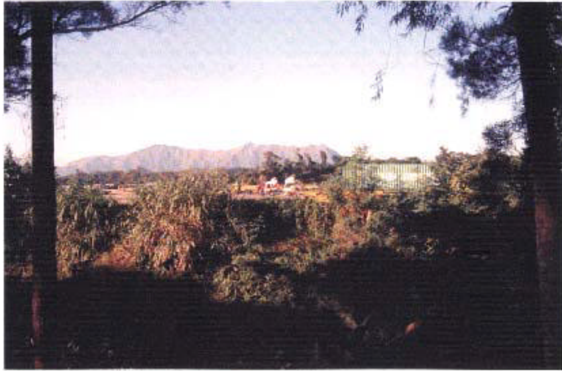
LCA1 - Former Whitehead Detention Centre LCA