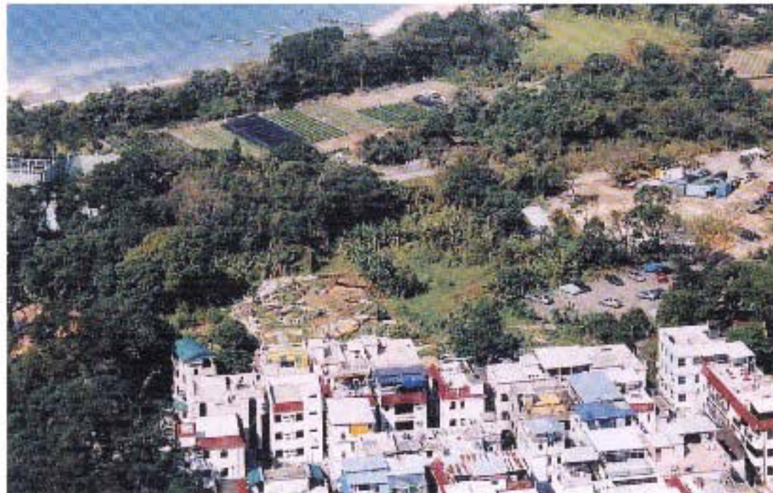
LCA4 - Wu Kai Sha LCA