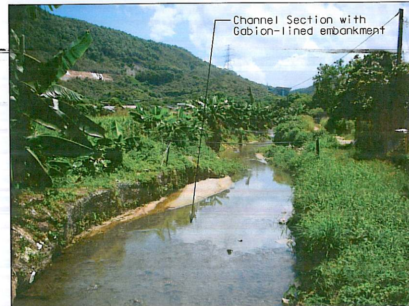
Photo No. A4 - LR1 River / Stream