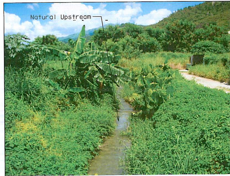
Photo No. A5 - LR1 River / Stream