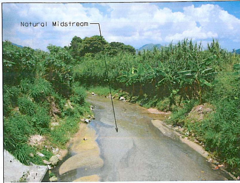
Photo No. A2 - LR1 River / Stream