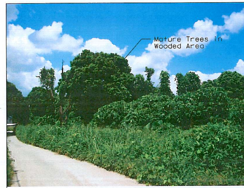
Photo No. A9 - LR4 Woodland / Wooded Area