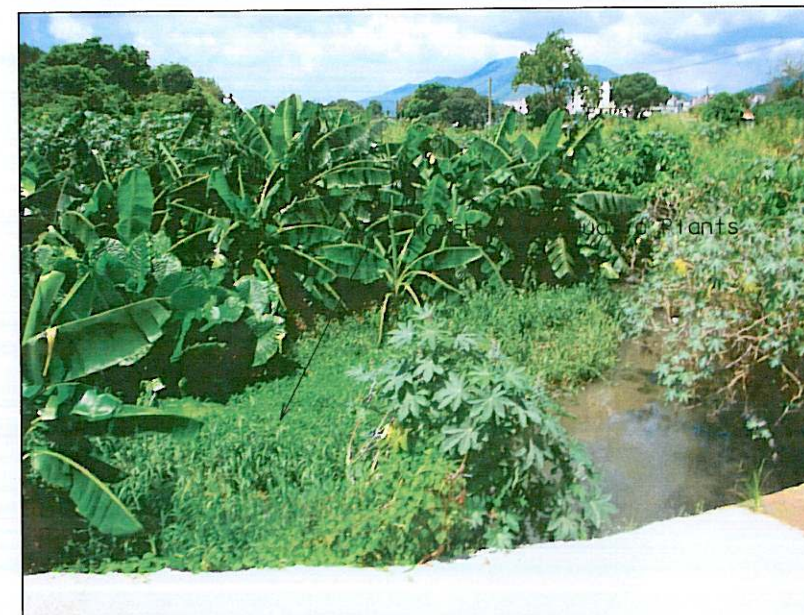
Photo No. A8 - LR3 Marsh