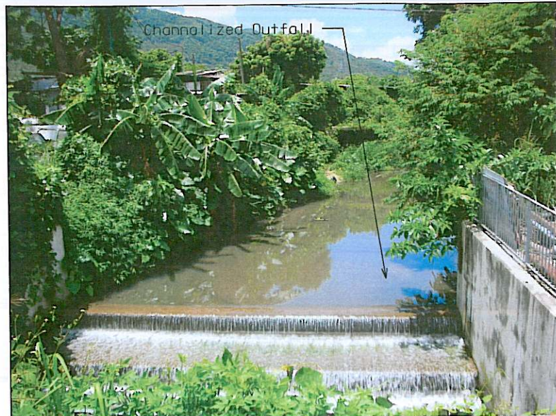
Photo No. A1 - LR1 River / Stream