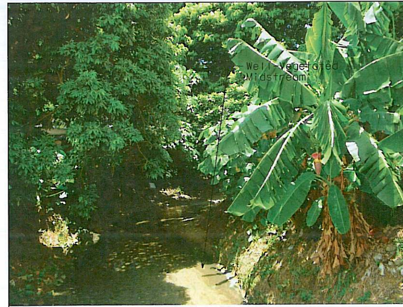
Photo No. A3 - LR1 River / Stream