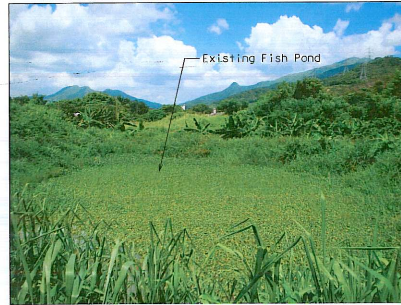
Photo No. A6 - LR2.1 Fish Ponds within Site Boundary