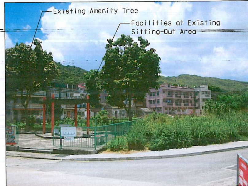
Photo No. A13 - LR7 Sitting-out Area at Ma On Kong