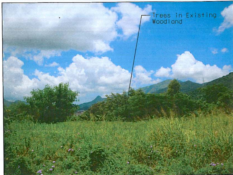
Photo No. A10 - LR4 Woodland