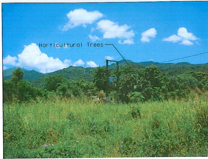
Photo No. A11 - LR5 Orchard/ Horticultural Land