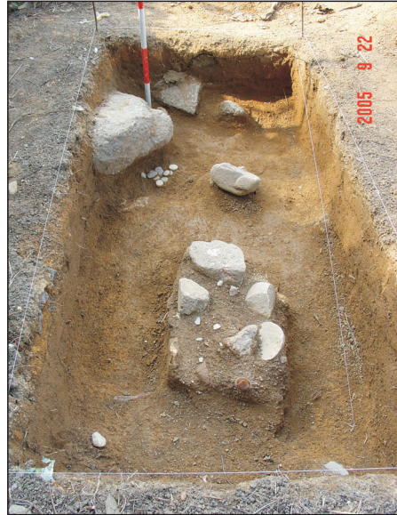
Feature 1 and Feature 2