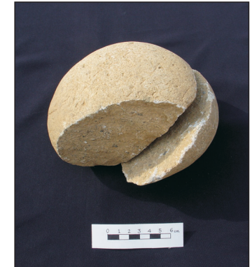
Broken stone that could be pieced together