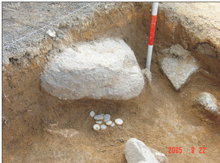
Feature 2 Cluster of Quartz Ring Discs