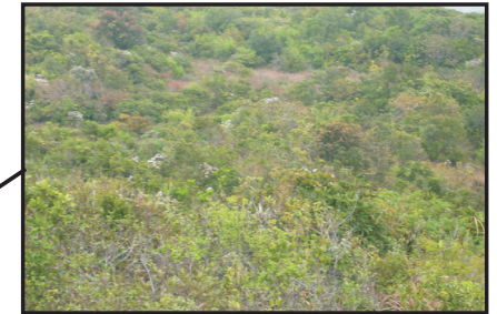
Shrubs dominated in the wind-sheltered area.