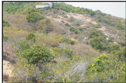
Bare ground found in the shrubland.