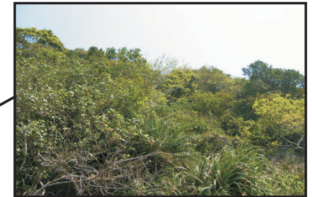
Shrubland at the fringe of secondary woodland densely covered by climbers and tall shrubs with a height of 1.5 m to 3.5 m.