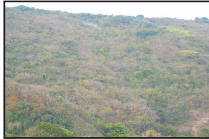
Plant species of low shrubland on the wind-facing slope were below 1.5 m in height. Higher percentage of grass cover was recorded.