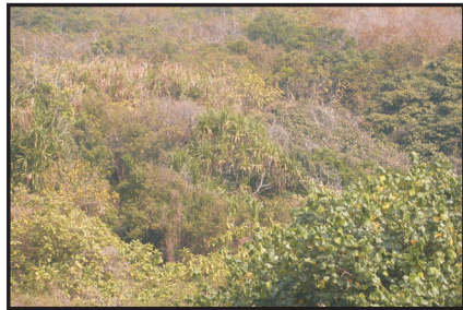
Shrubland at the back of the rocky shore dominated by backshore vegetation such as the common Pandanus sp.