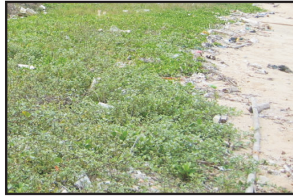
Rubbish found in the vegetation of the backshore shrubland.