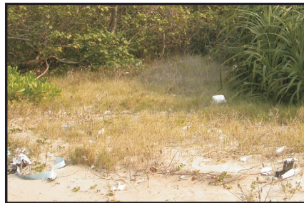
Rubbish found in the backshore shrubland during high tide. Pandanus tectorius which is very common in Hong Kong was one of the dominant plant species in the backshore shrubland.