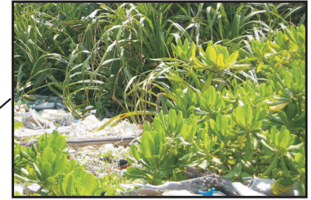
Rubbish found in the vegetation of the backshore shrubland.