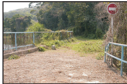
Concrete path surrounding the abandoned reservoir with a weed covering.