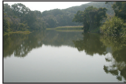
Overview of the abandoned reservoir