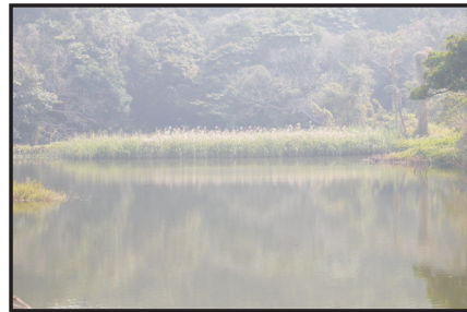
Abandoned wet agricultural land located at the fringe of the abandoned reservoir.