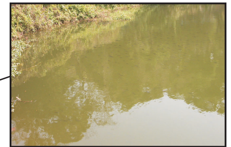
Plant species were restricted to the pond bund of the reservoir.