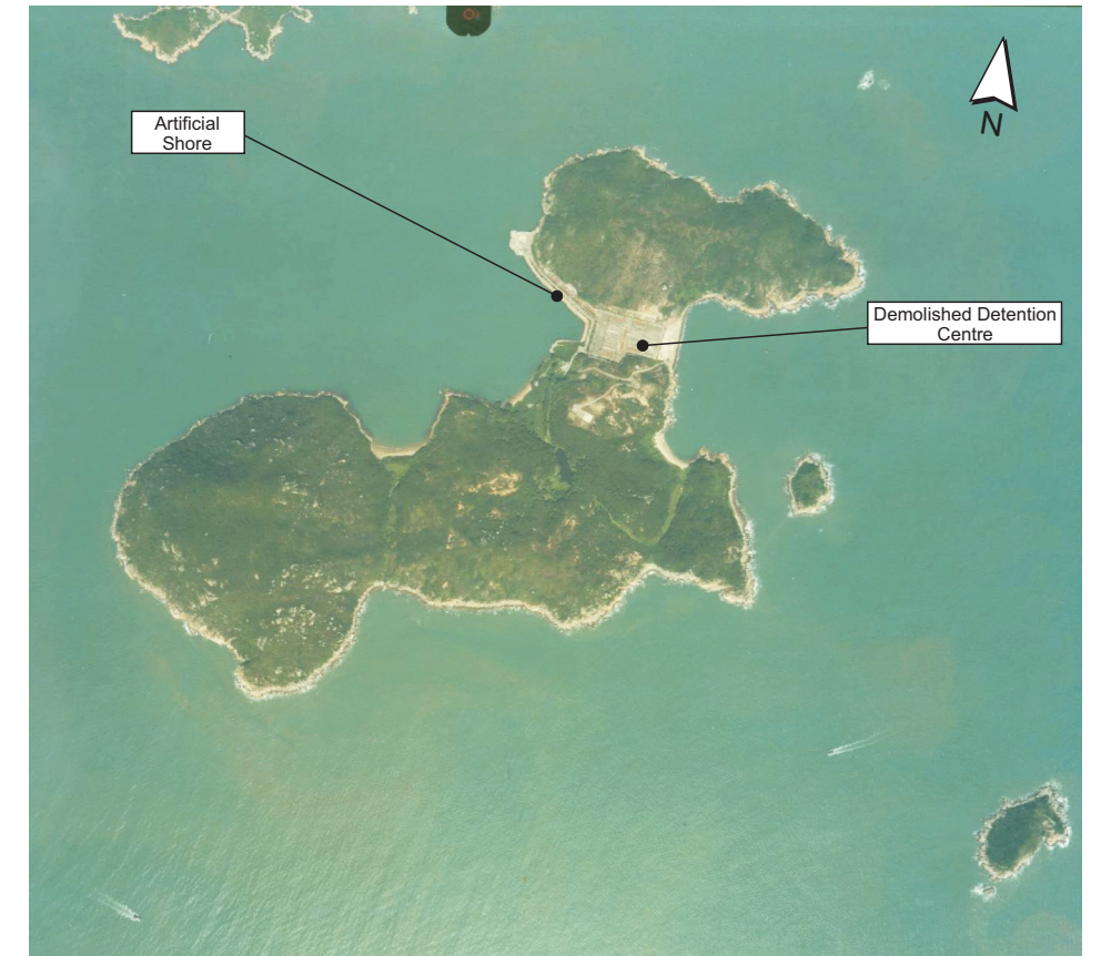
Aerial Photograph of South Soko at 2004 - This aerial photograph presents the existing condition of South Soko (Detailed Habitat Map is presented in Figure 3.4a)