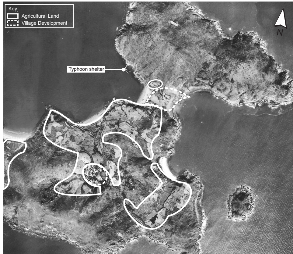
Aerial Photograph of South Soko from 1963 - A number of inhabitants were living on South Soko Island and most of the lowland areas were modified as agricultural land