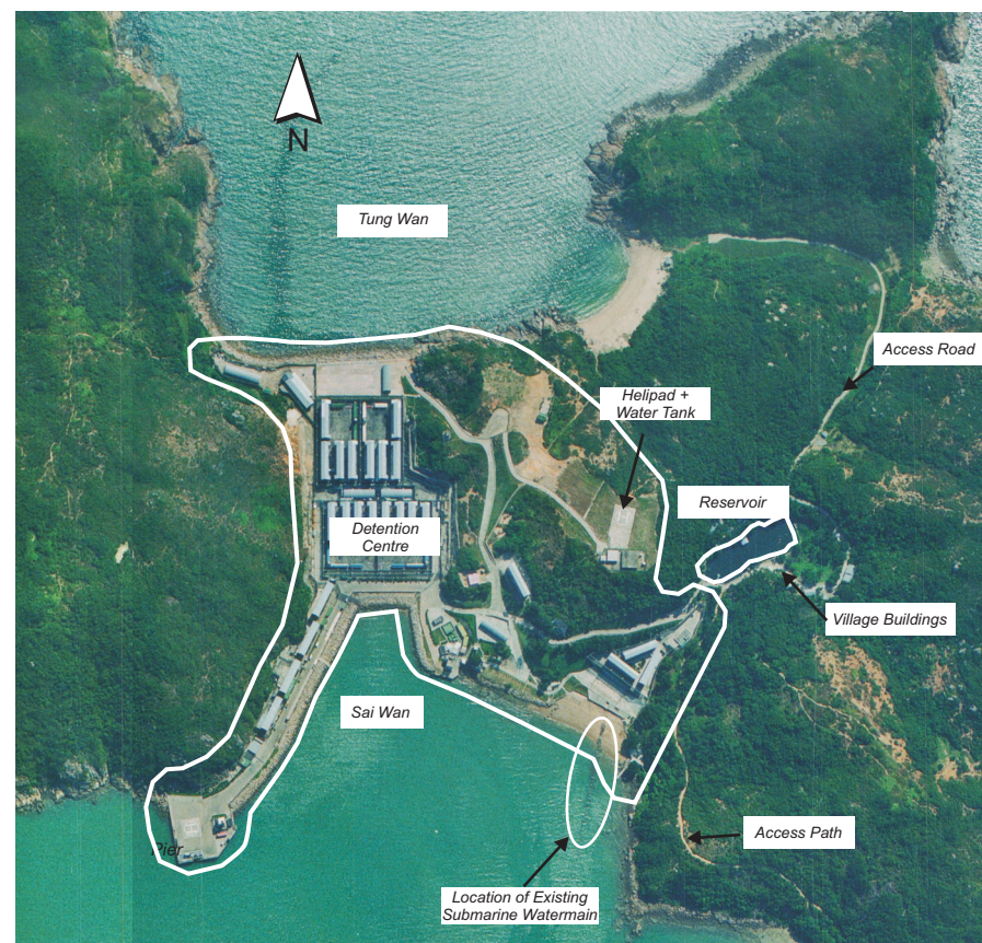
Detention Centre was in place at 1994