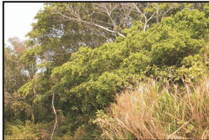
Secondary woodland located at the west of abandoned reservoir comprises mainly native trees and fruit trees planted by local villagers long ago, such that the ecological importance is considered moderate.