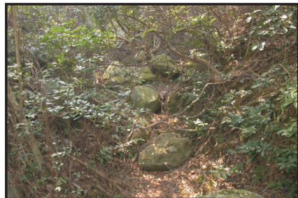
Secondary Woodland was found at the Southwest of a Natural stream.