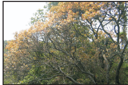
Native and common plant species Ficus superba found at the fringe of secondary woodland.