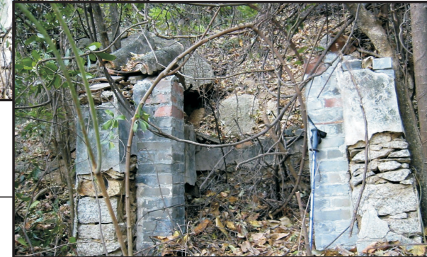
Facade of Building Structure 2a