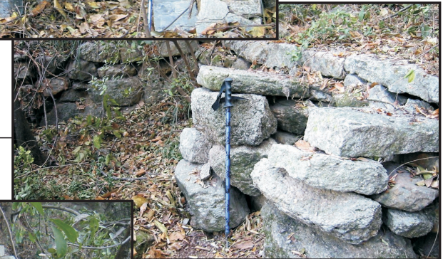
Platform of Structure 2b