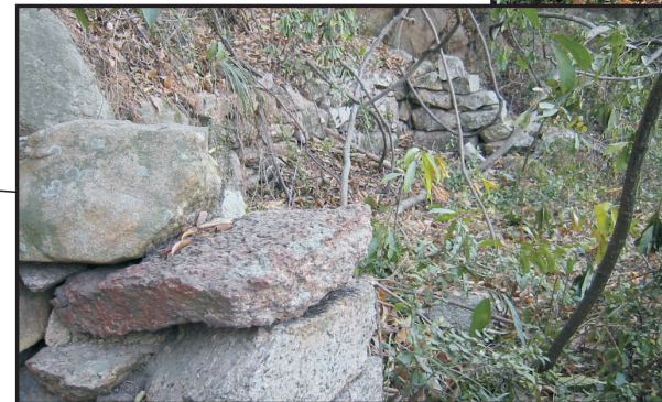
Stone Wall Structure of Structure 2b