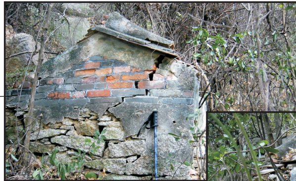
Gable of Building Structure 2a