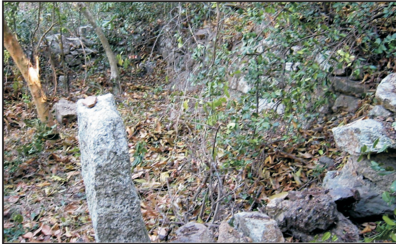
Stone Wall Structure