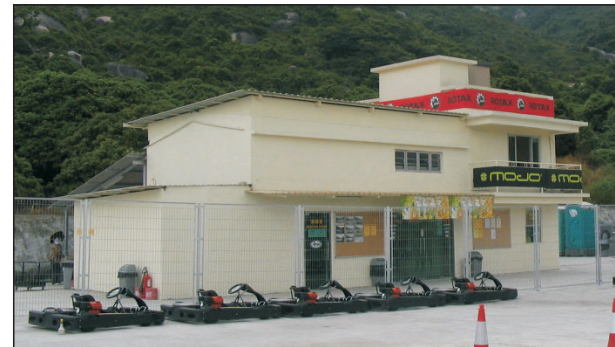
Photo 2 - The village house is used as an office.