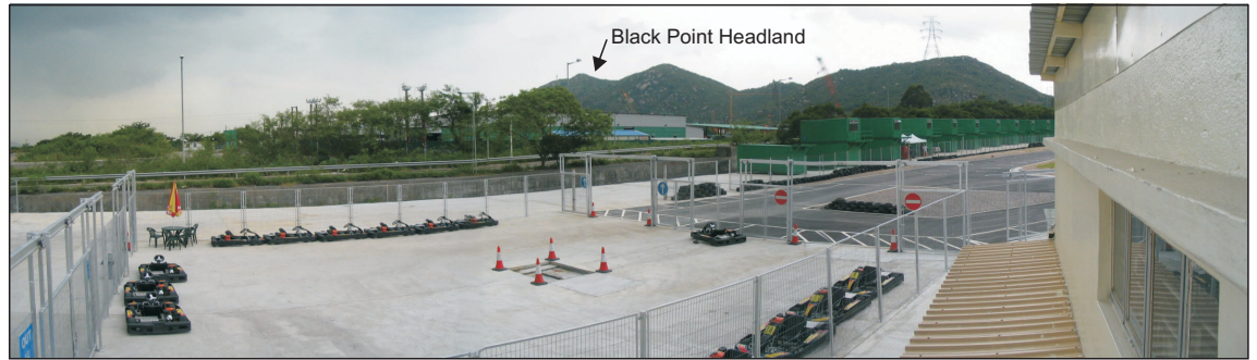
Photo 1 - Photograph taken at the highest floor of village house to the west showing the village house is screened by the patch of Acacia plantation of about 3m high adjacent Lung Kwu Tan Road as well as containers.