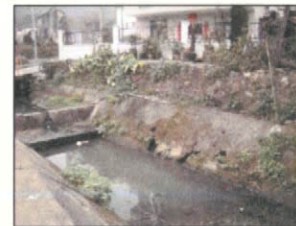
(view towards the river bank)

*Refer to Figure No. 8.4B: Location of Visual Sensitive Receivers & Zone of Visual Influence Plan