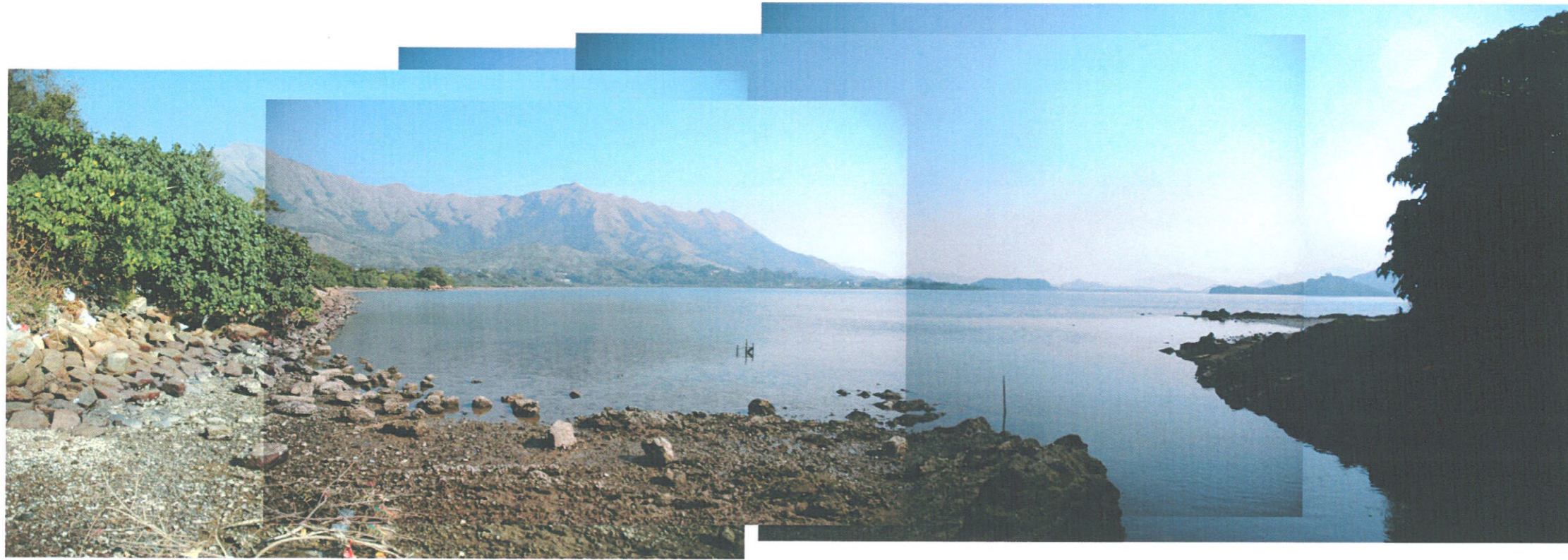
LCA 1 - NATURALISTIC SEA BAY : OPEN AND NATURAL COASTLINES OF MANGROVES, BEACHES, AND SMALL SEASIDE WOODLANDS