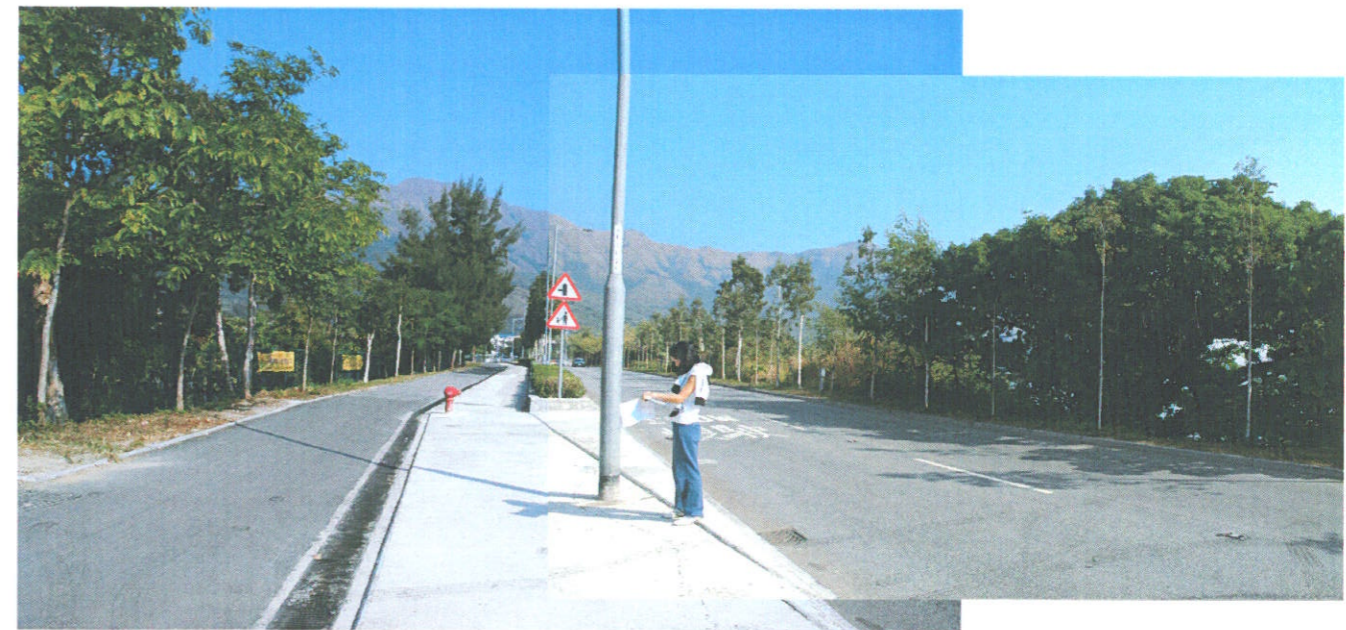
LCA 2 - SUBURBAN ROAD : TING KOK ROAD WITH STRONG SENSE OF SUBURBAN ENVIRONMENT