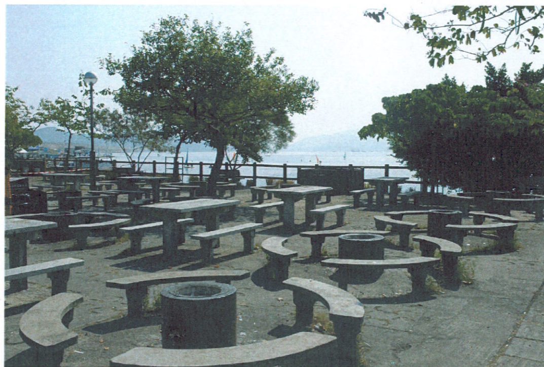
VSR9 - TAI MEI TUK