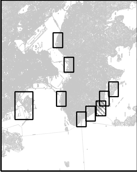
LOCATION PLAN SCALE 1:60000