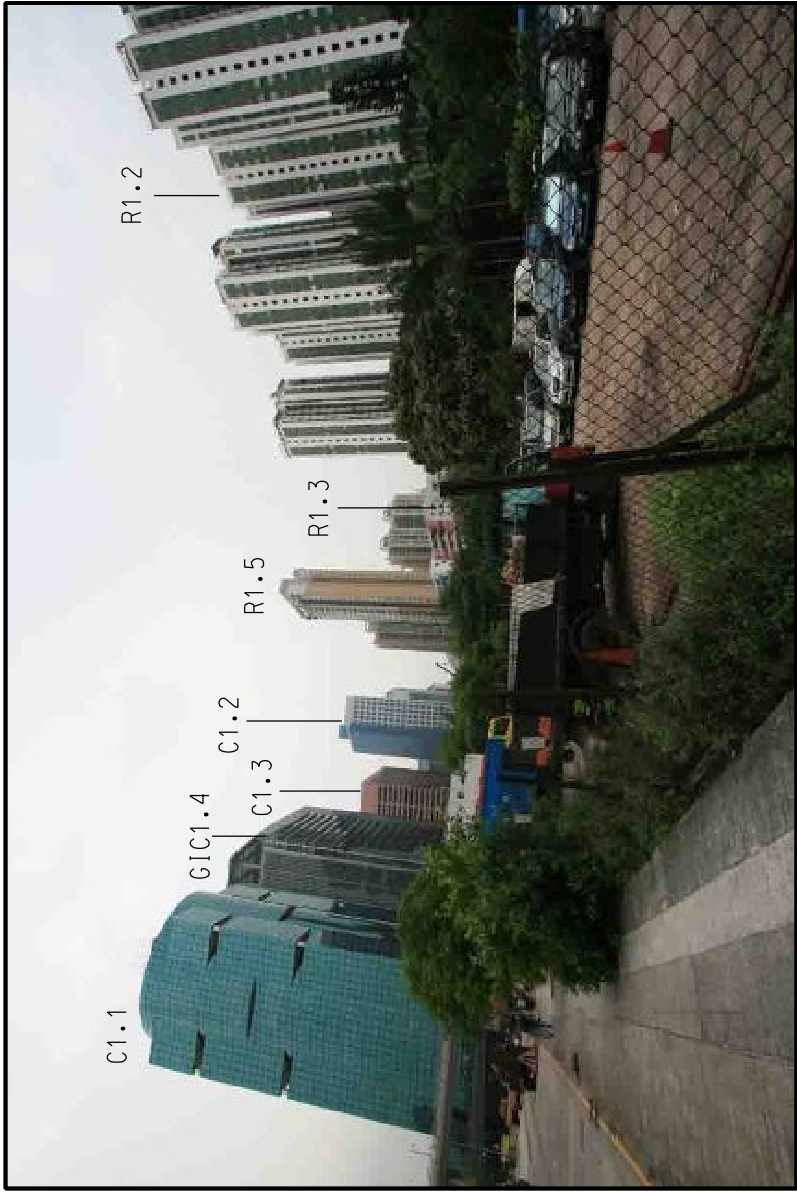
C1.1, C1.2, C1.3, R1.2, R1.3, R1.5, GIC1.4