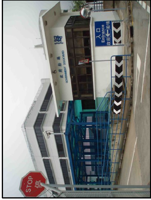
G1C9.1 GOVERNMENT DOCKYARD