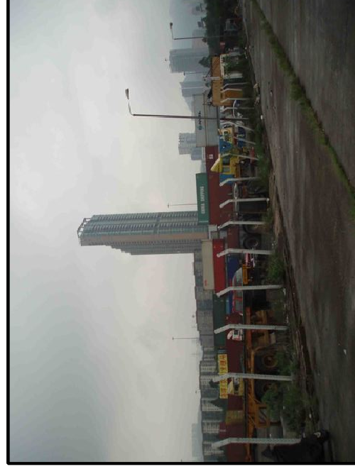
O09.3 OPEN STORAGE CAR PARK