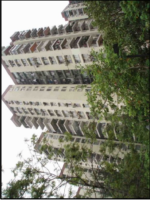
R9.1 MEI FOO SUN CHUEN