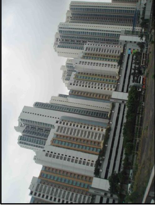
R9.3 FU CHEONG ESTATE R9.4 NAM CHEONG ESTATE