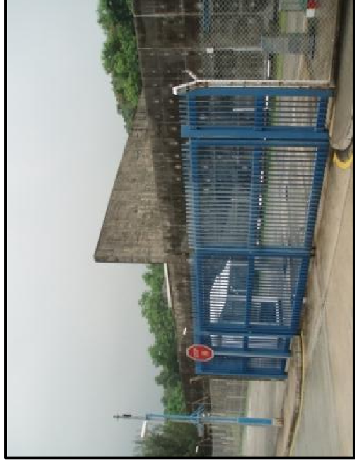
O09.1 NGONG SHUEN CHAU BARRACKS