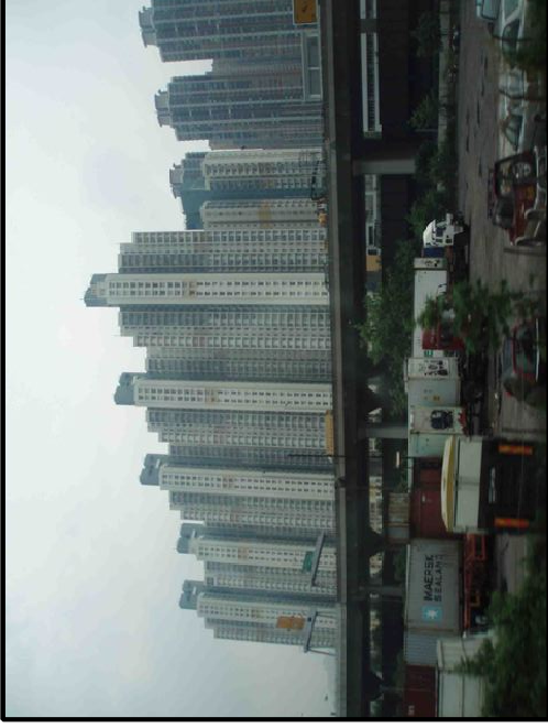
R9.2 HOI LAI ESTATE