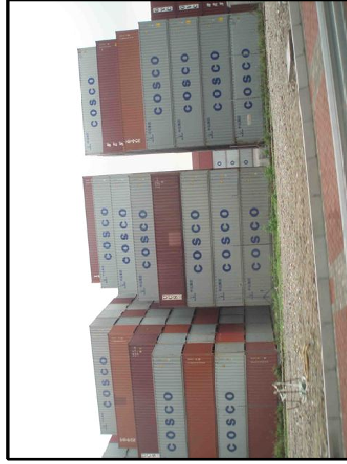
O09.2 CONTAINER TERMINAL 8