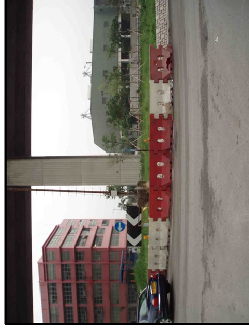
O09.4 WEST KOWLOON REFUSE TRANSFER STATION