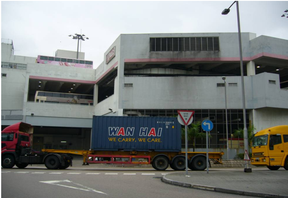
LOCATION 5 KOWLOON MOTOR BUS DEPOT