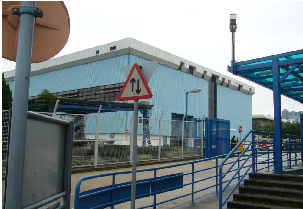
LOCATION 1 GOVERNMENT DOCKYARD