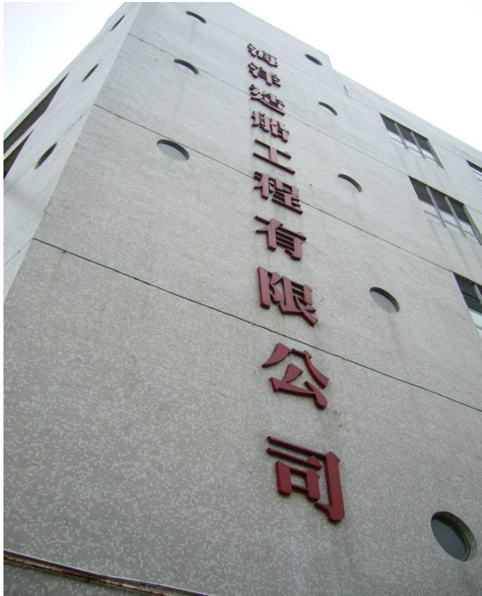
LOCATION 5 OCEAN SHIP BUILDING ENGINEERING