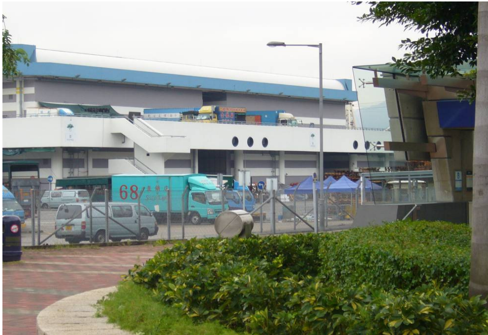
LOCATION 16 CHEUNG SHA WAN WHOLESALE FOOD MARKET OFFICE