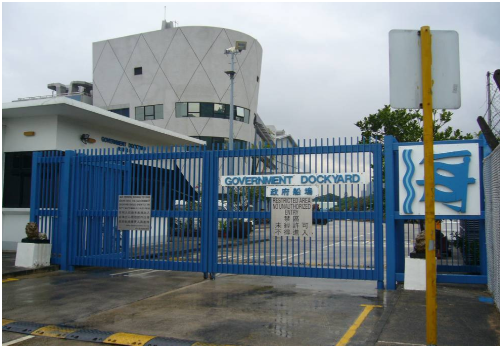
LOCATION 1 GOVERNMENT DOCKYARD