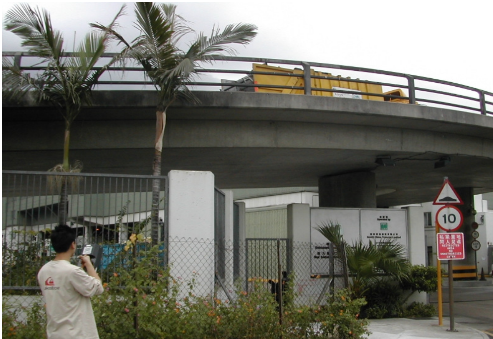
LOCATION 3 WEST KOWLOON REFUSE TRANSFER STATION