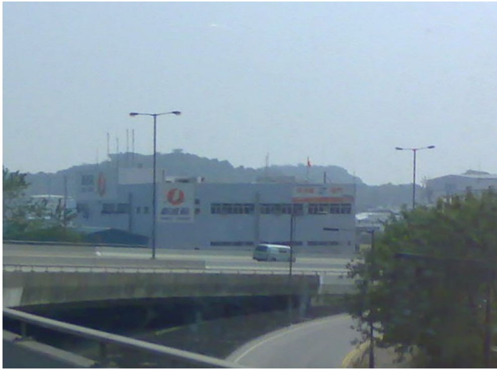
LOCATION 15 NEW WORLD FIRST FERRY