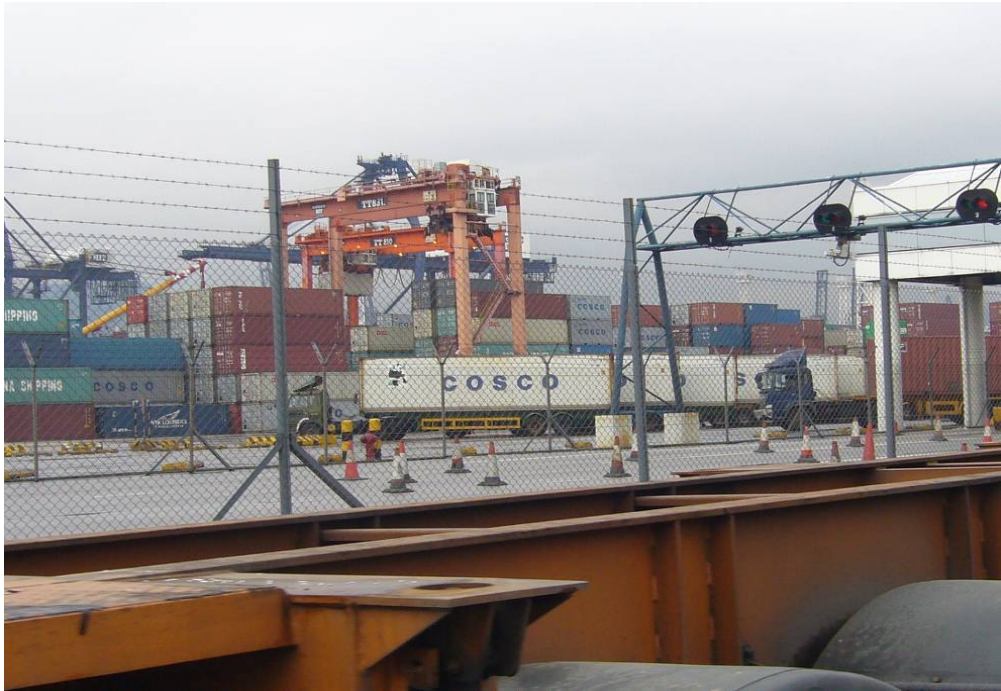
LOCATION 7 CONTAINER TERMINAL 7 AND 8