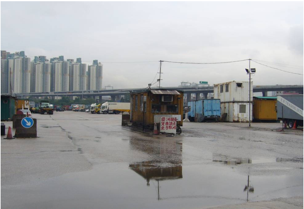
LOCATION 6 CAR PARK (OPEN STORAGE)