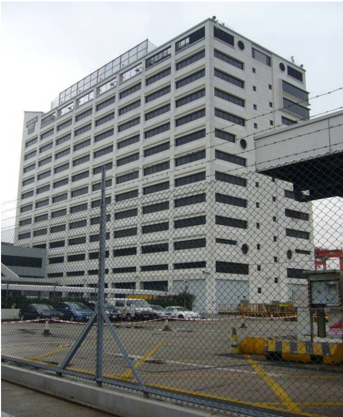
LOCATION 7 CONTAINER TERMINAL 7 AND 8 (COSCO-HIT)