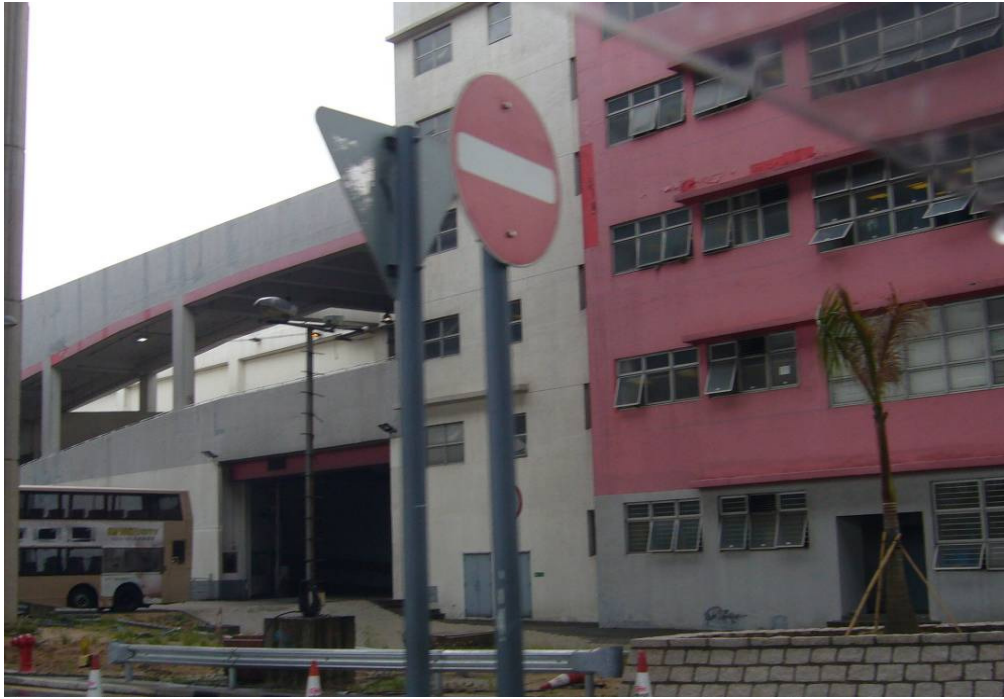
LOCATION 5 KOWLOON MOTOR BUS DEPOT