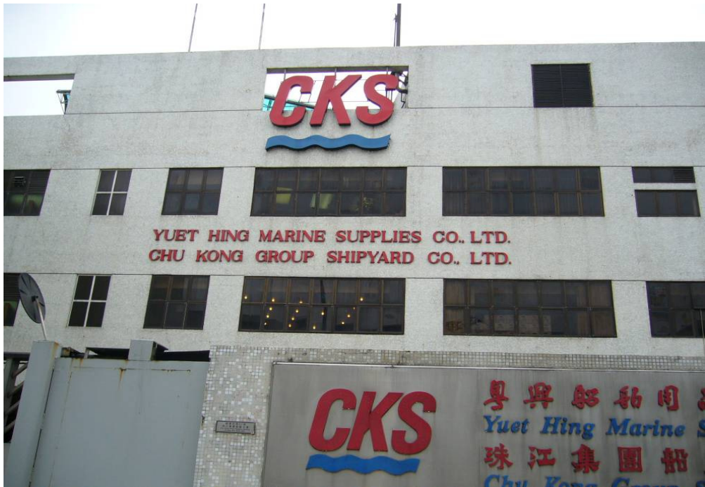
LOCATION 5 YUET HING MARINE SUPPLIES COMPANY LIMITED