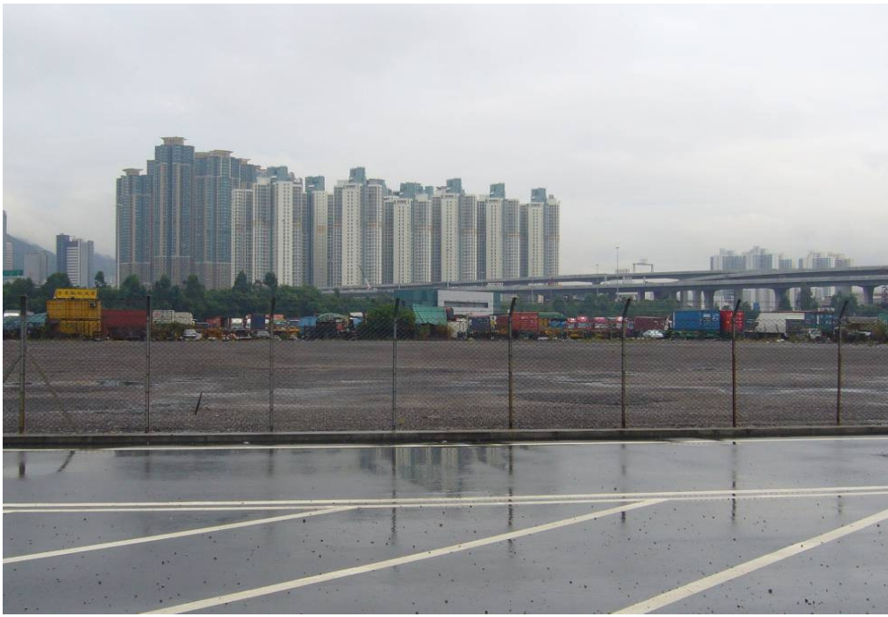
LOCATION 6 CAR PARK (OPEN STORAGE)