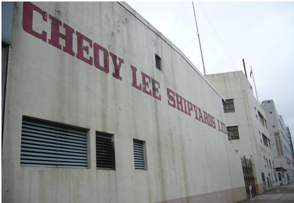
LOCATION 5 CHOY LEE SHIPYARD LIMITED