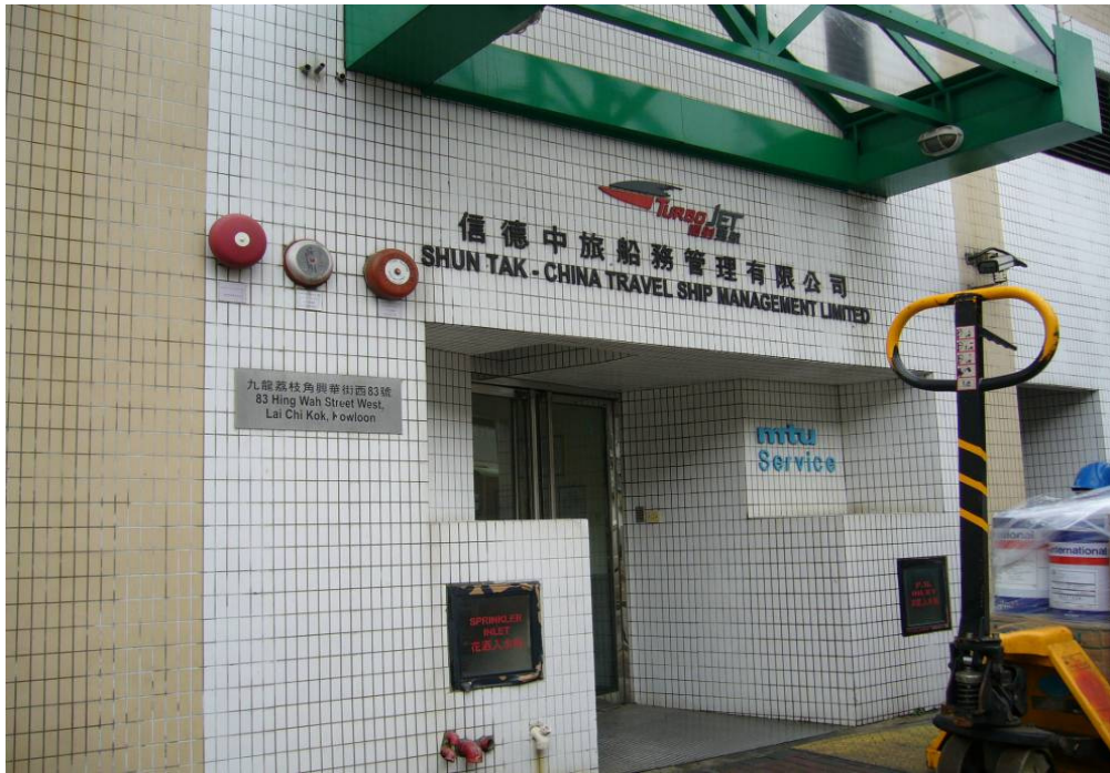
LOCATION 5 CHINA TRAVEL SERVICE PARKVIEW SHIPYARD BUILDING