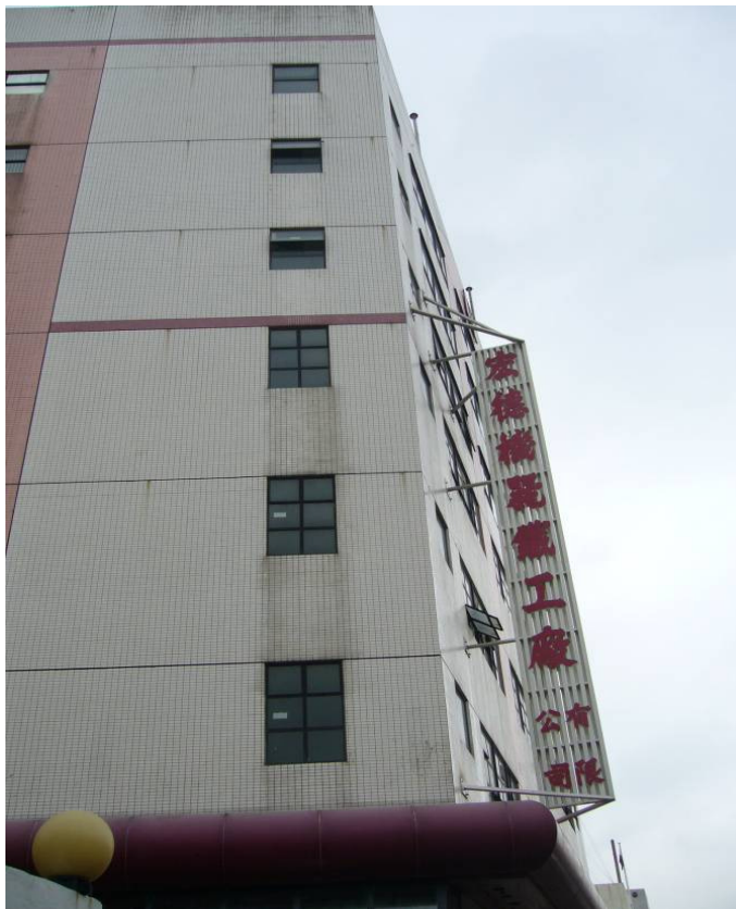
LOCATION 5 WANG TAK BUILDING