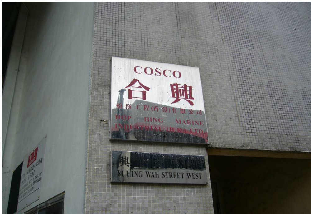
LOCATION 5 HOP HING MARINE INDUSTRIAL (HK) LIMITED