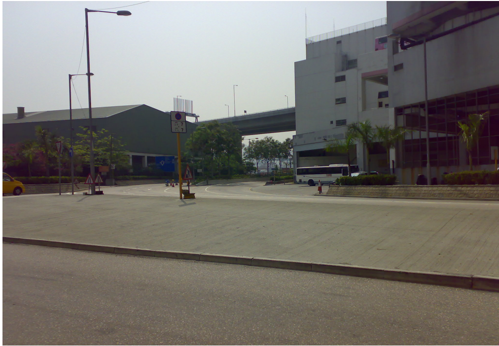
LOCATION 3 WEST KOWLOON REFUSE TRANSFER STATION