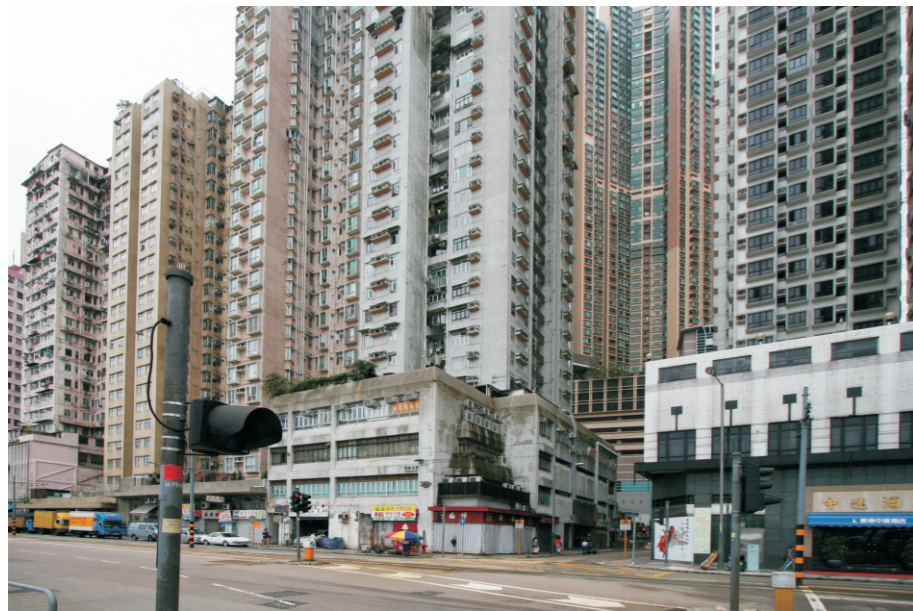
LCA1.2 City Grid Mixed Urban Landscape (University)