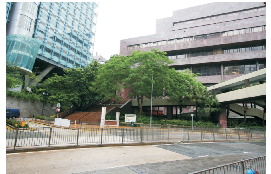
LCA3.2 Open Institutional Landscape (University)