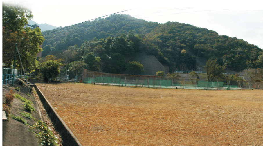
LCA2.2 Mix-Use Urban Fringe Landscape (University)