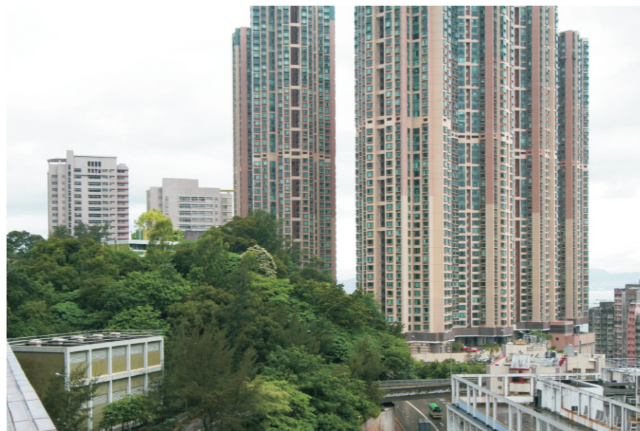
LR6.2 Residential Urban Fringe Landscape (University)