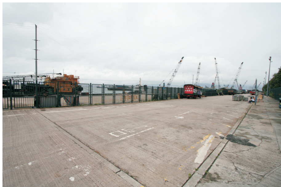
LCA5 Inshore Water Landscape