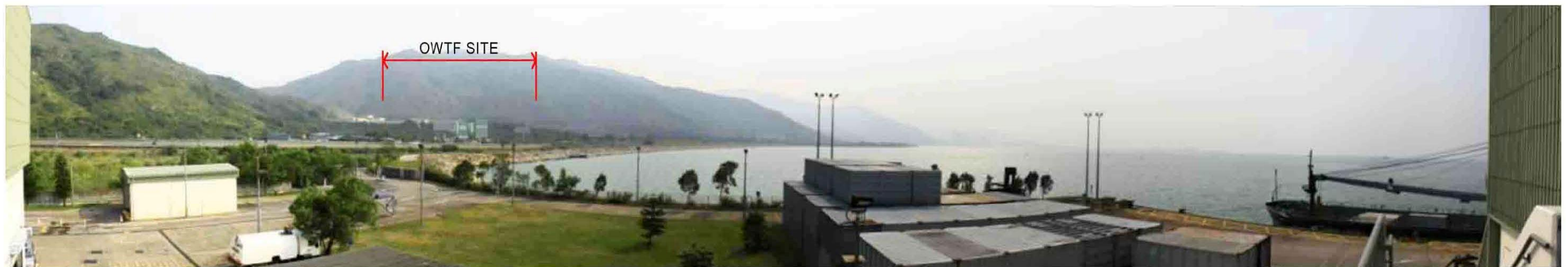
VSR6 VIEW ANGLE "C"

View from North Lautau Refuse Transfer Station