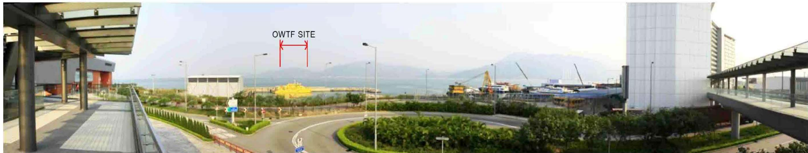
VSR7 VIEW ANGLE "A" View from Asia World EXPO.