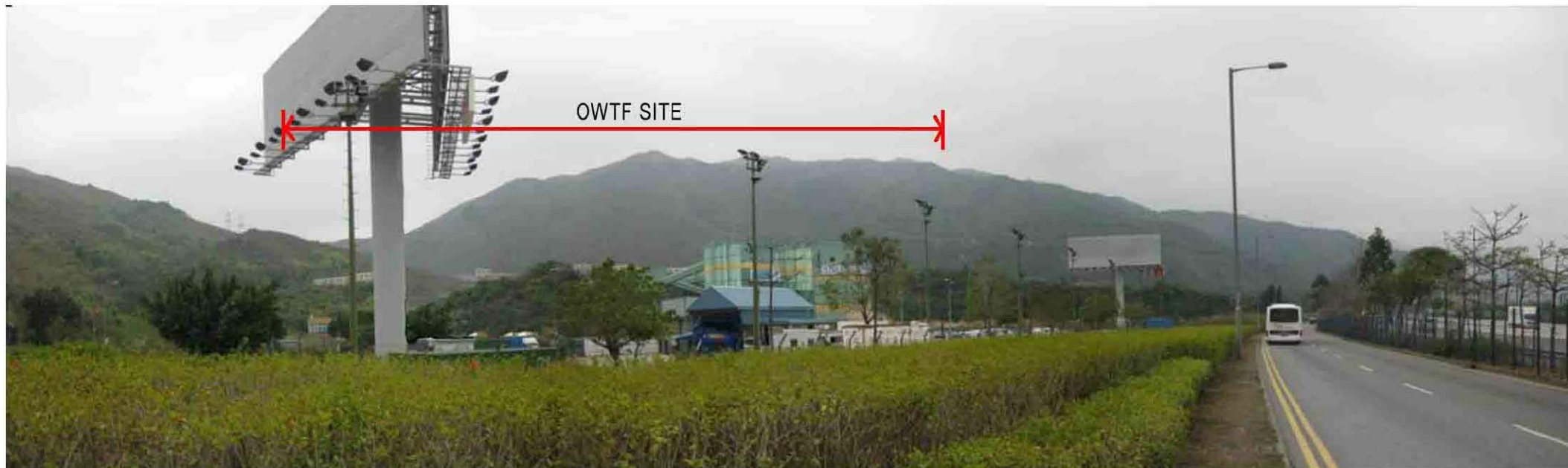
VSR4 VIEW ANGLE "B" View from Sham Fung Road

* NOTE: AS PHOTO TAKING FROM (VSR4) NORTH LANTAU HIGHWAY IS UNSAFE BECAUSE OF HIGH SPEED VEHICLES, SHAM FUNG ROAD IS USED AS INDICATIVE VIEWS FROM (VSR4) WITH EXCEPTION THAT THE ACTUAL VIEW WOULD BE MORE OBSCURED BY THE BUFFER TREE PLANTING & THE HIGH SPEED REDUCES THE VIEW DETAIL.