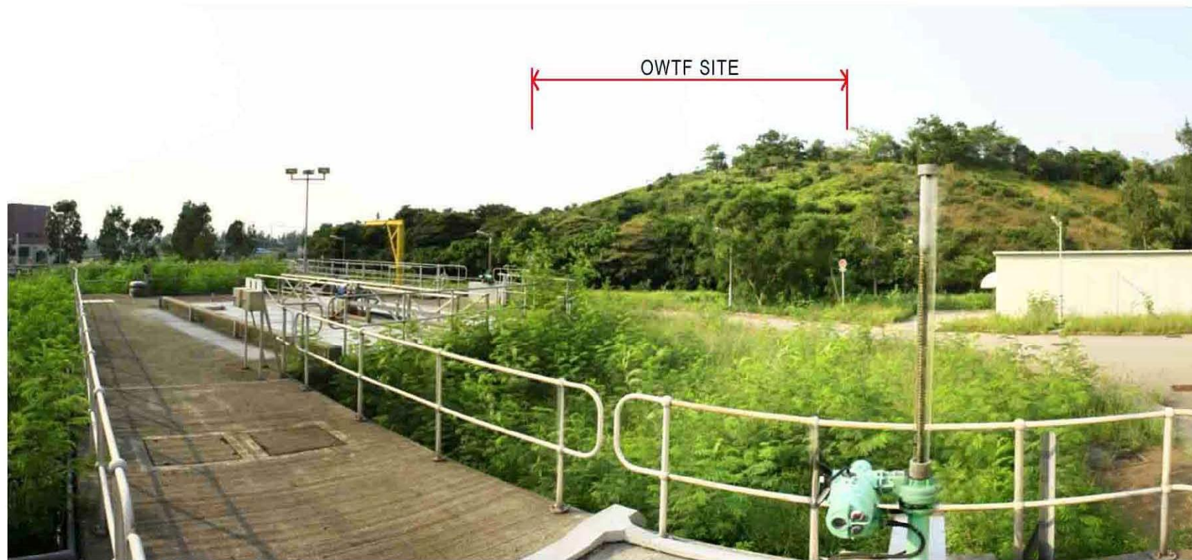
VSR5 VIEW ANGLE "A" View from Siu Ho Wan Sewage Treatment Works