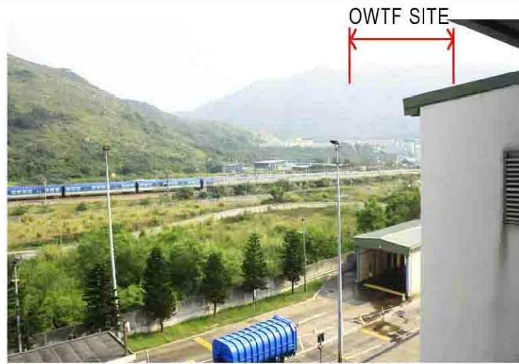
VSR6 VIEW ANGLE "A"

View from North Lautau Refuse Transfer Station