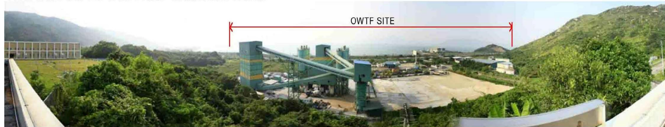
VSR3 VIEW ANGLE "B"

View from Siu Ho Wan Water Treatment Works