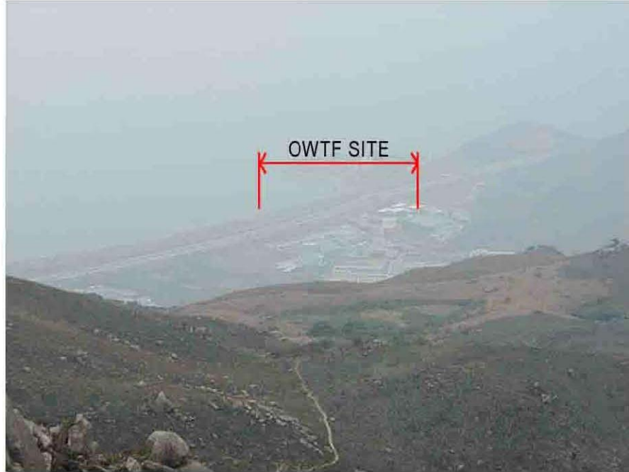
VSR 10 VIEW ANGLE "A" View from Lantau North (Extension) Country Park Hikers