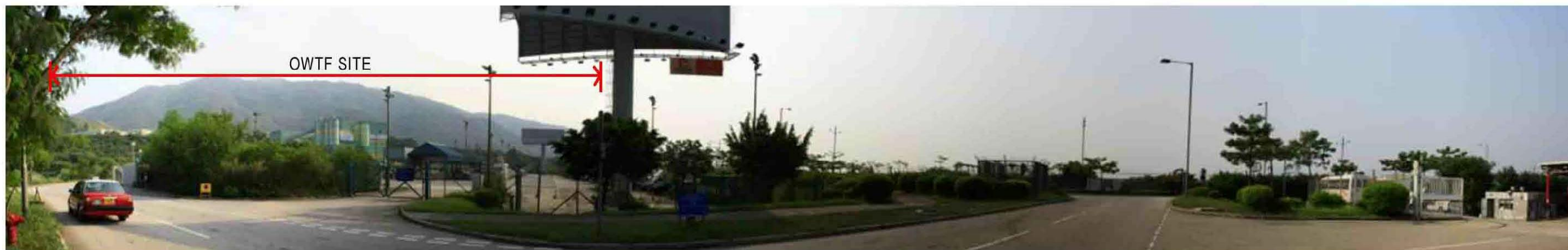
VSR2 VIEW ANGLE "A" View from Outside the Bus Depots