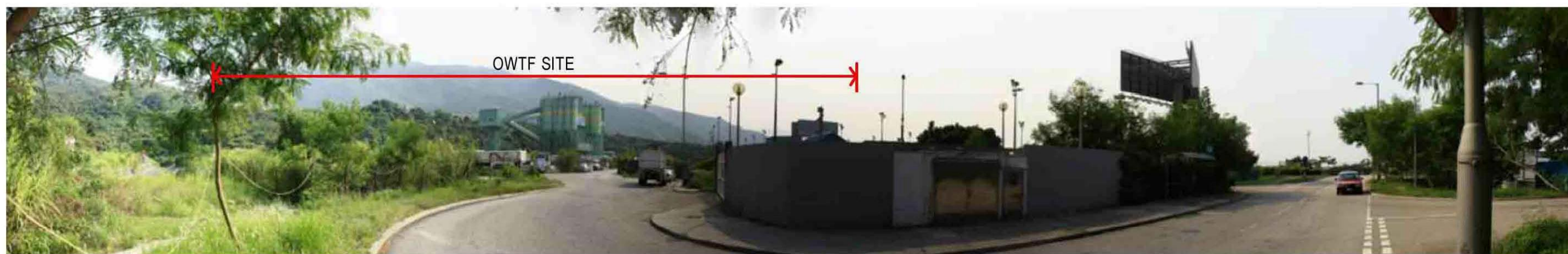
VSR2 VIEW ANGLE "B" View from Outside the Bus Depots