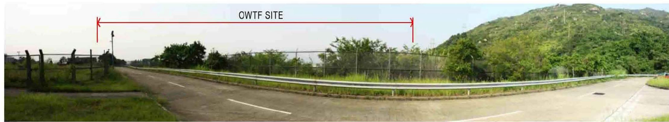
VSR3 VIEW ANGLE "A"

View from Siu Ho Wan Water Treatment Works