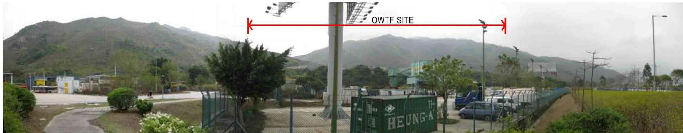
VSR4 VIEW ANGLE "A" View from Sham Fung Road

* NOTE: AS PHOTO TAKING FROM (VSR4) NORTH LANTAU HIGHWAY IS UNSAFE BECAUSE OF HIGH SPEED VEHICLES, SHAM FUNG ROAD IS USED AS INDICATIVE VIEWS FROM (VSR4) WITH EXCEPTION THAT THE ACTUAL VIEW WOULD BE MORE OBSCURED BY THE BUFFER TREE PLANTING & THE HIGH SPEED REDUCES THE VIEW DETAIL.