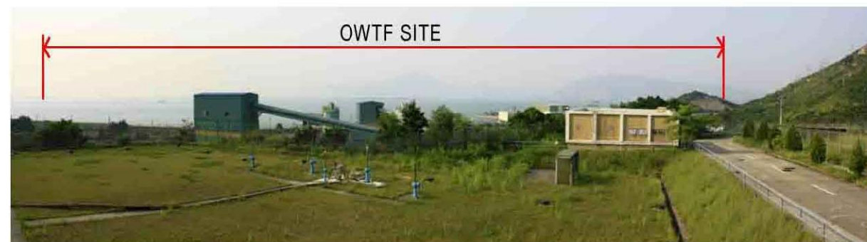
VSR3 VIEW ANGLE "D"

View from Siu Ho Wan Water Treatment Works