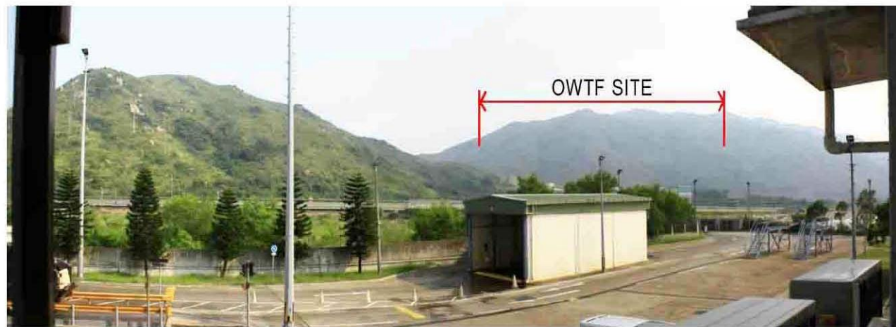
VSR6 VIEW ANGLE "B"

View from North Lautau Refuse Transfer Station