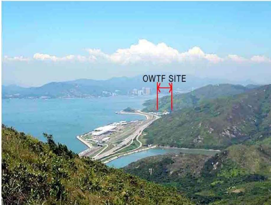
VSR 10 VIEW ANGLE "B" View from Lantau North (Extension) Country Park Hikers