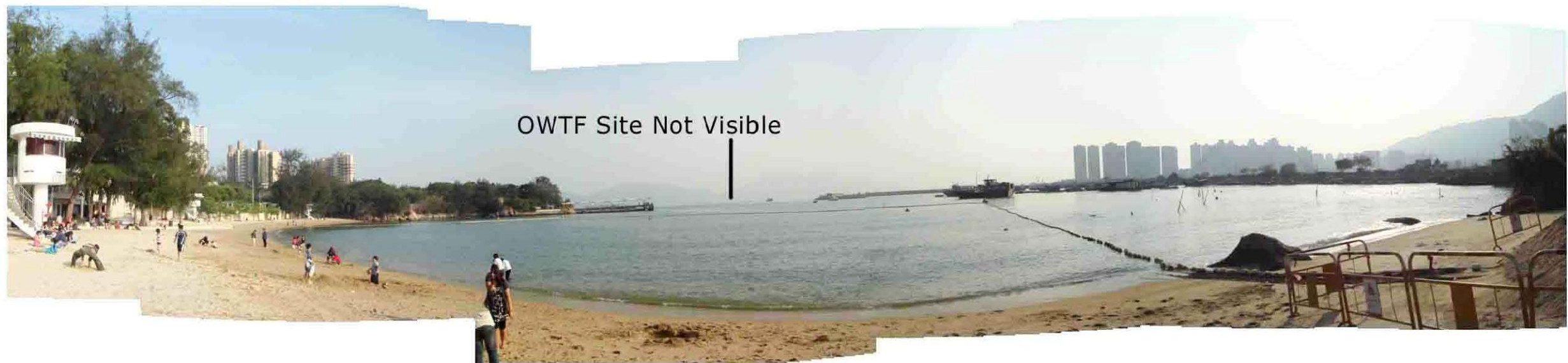
VSR9 VIEW ANGLE "A" View from Butterfly Beach