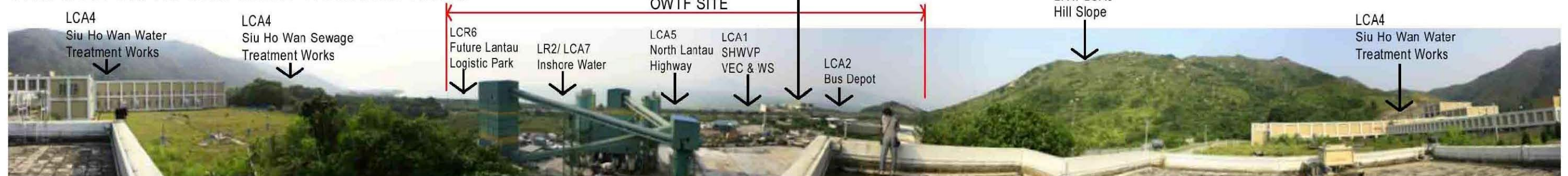
VSR3 VIEW ANGLE "C"

View from Siu Ho Wan Water Treatment Works