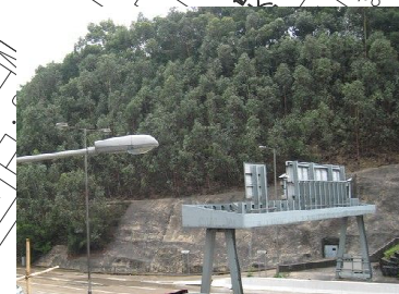
HB4: K5 Air Raid Protection Tunnels These tunnels served some workers from former Whampoa Dock back to World War II in 1940s during the invasion of Kowloon by the Japanese in which the dockyard was heavily bombed by Japanese aircraft with large casualties.

HB4: Tunnel Network K5 HB9: Nos. 179 to 181 Bulkeley Street HB10: No. 7A Winslow Street HB32: No. 68 Bulkeley Street