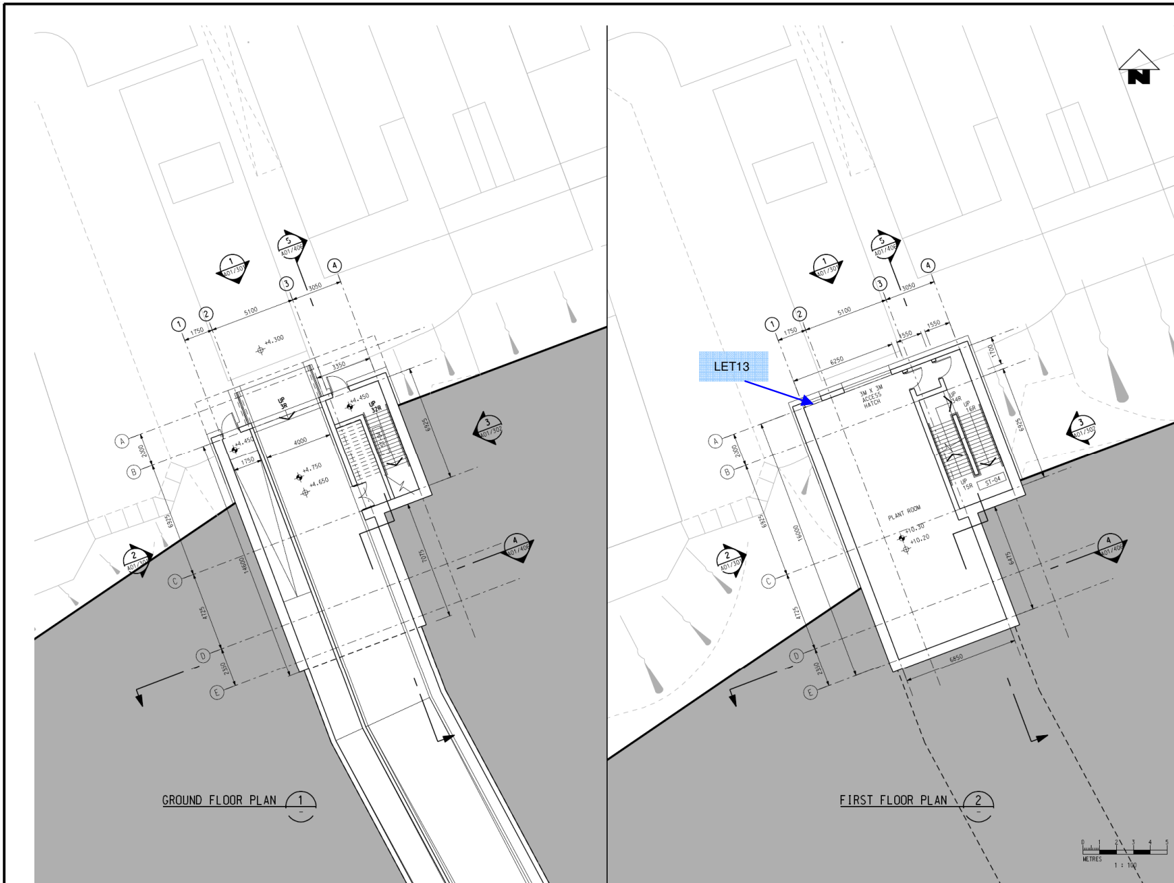
Lei Tung Station Entrance A