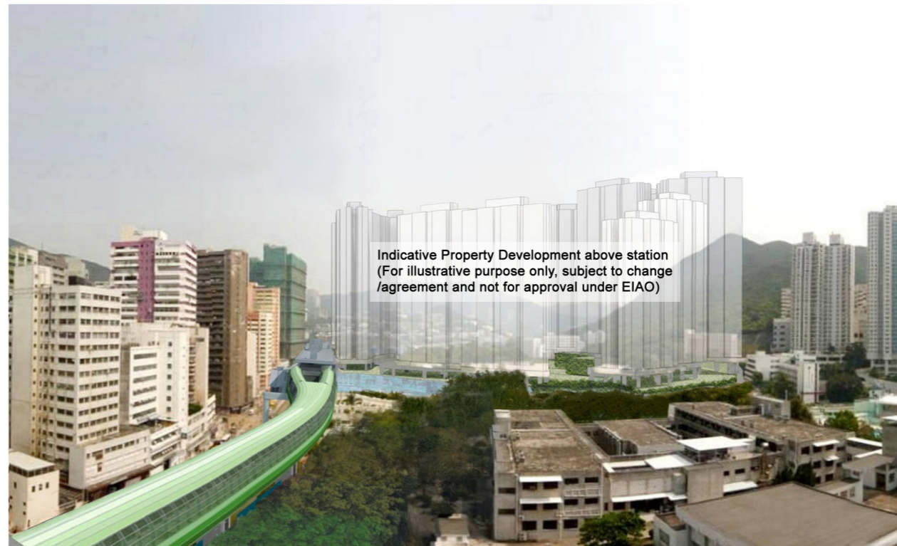
Year 10 of Operation Phase with landscape mitigation measures fully established