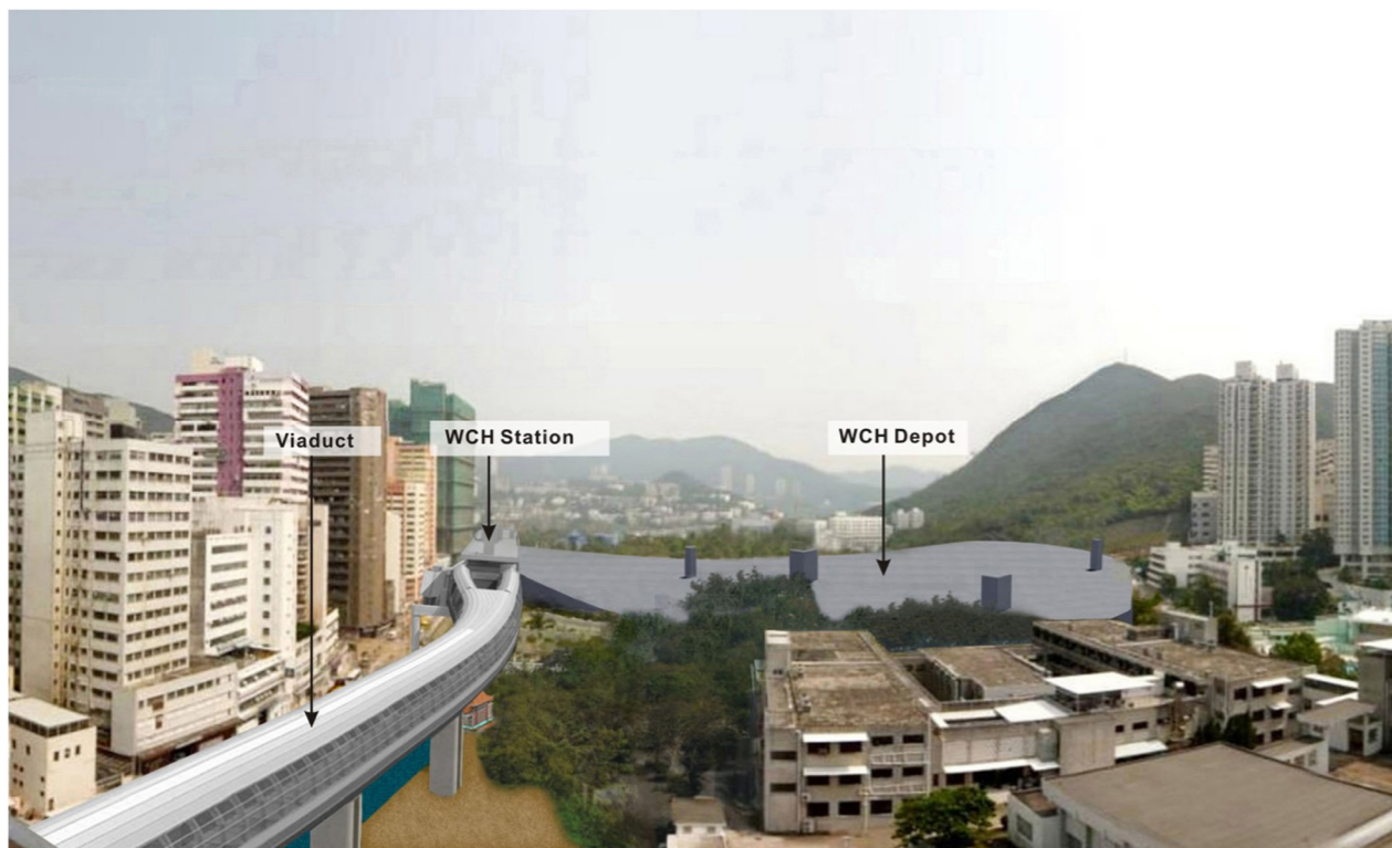
Day 1 of Operation Phase without landscape mitigation measures