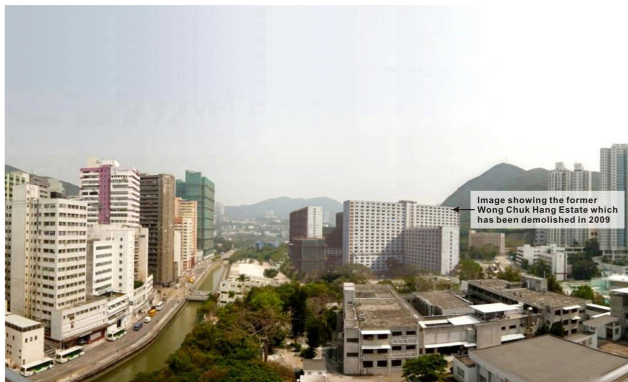
Existing Condition Vantage Point I - View east at elevated levels within the Rehabilitation Complex looking towards proposed viaduct from WCH Station