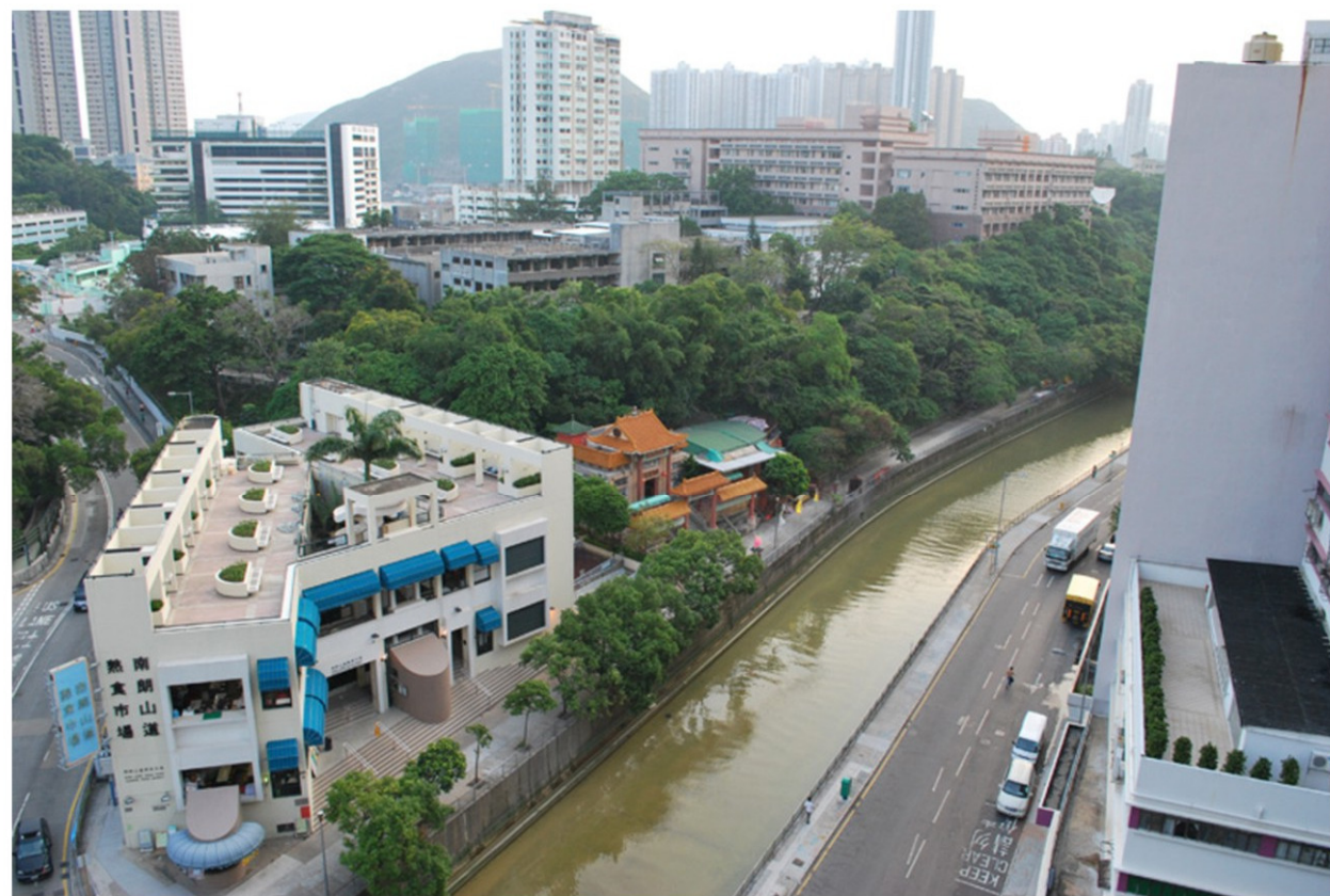
Existing Condition Vantage Point H - View west at an elevated level of industrial building at Heung Yip Street looking towards the proposed viaduct from WCH Station