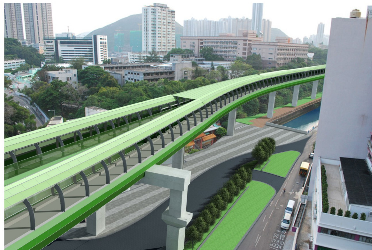
Year 10 of Operation Phase with landscape mitigation measures fully established