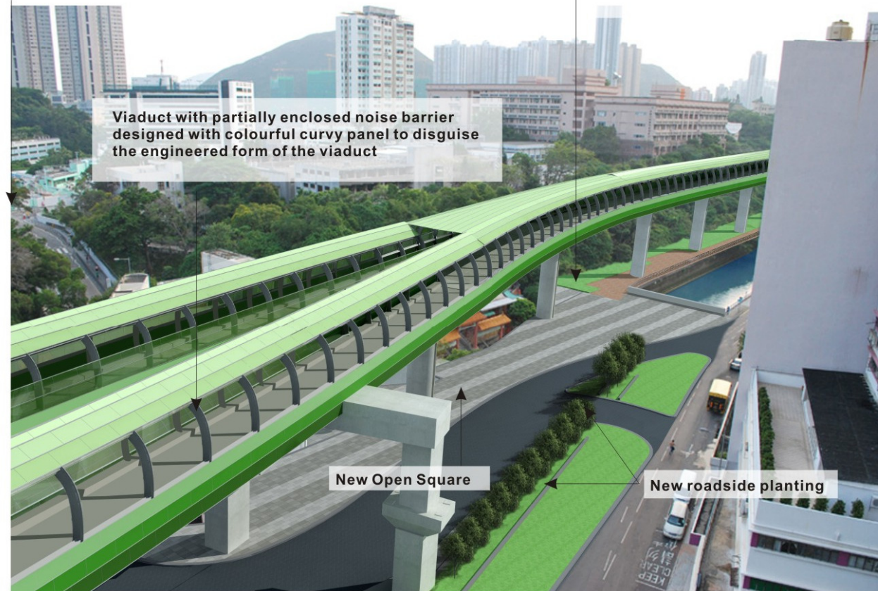
Day 1 of Operation Phase with landscape mitigation measures