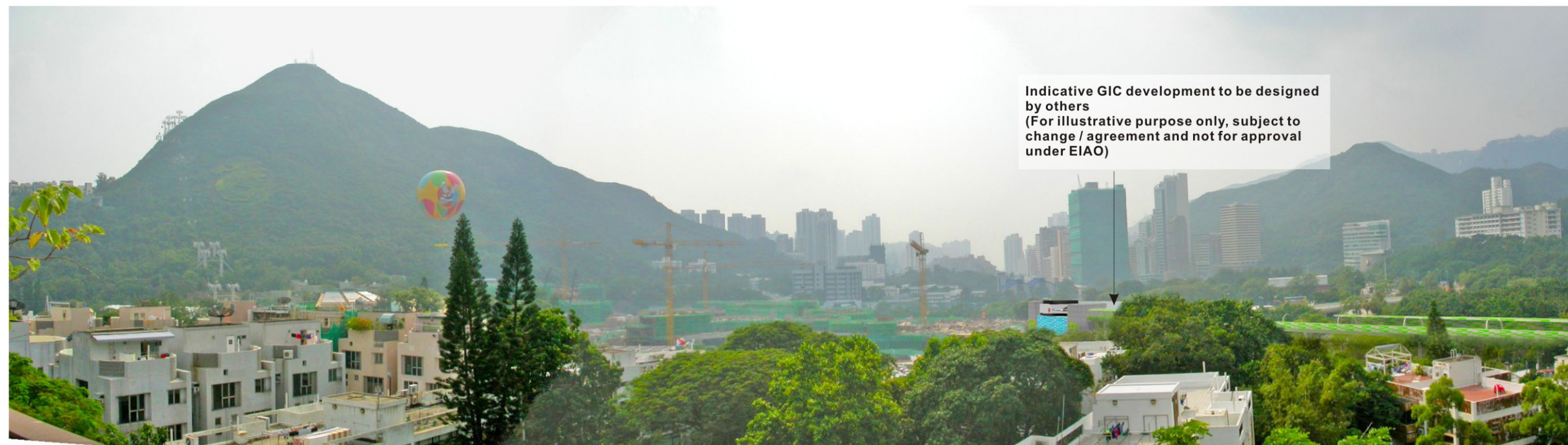
Year 10 of Operation Phase with landscape mitigation measures fully established