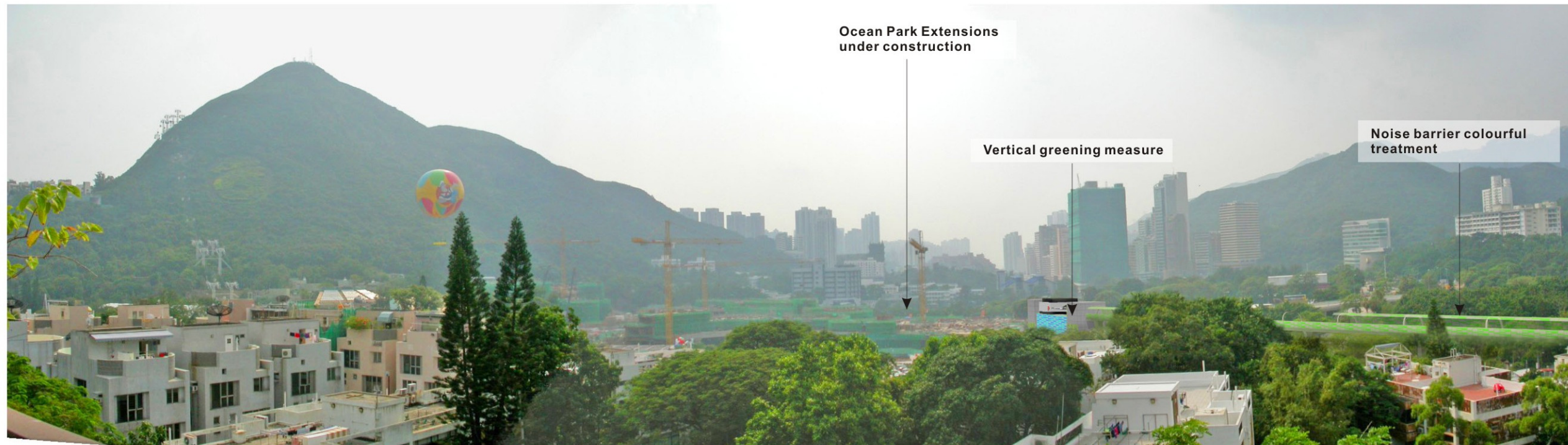
Day 1 of Operation Phase with landscape mitigation measures